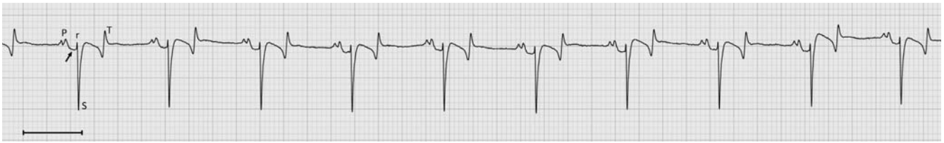
Figure 1. Normal sinus rhythm with P wave, QRS complex and T wave. The arrow indicates T_a wave, the line bar indicates 1 second.