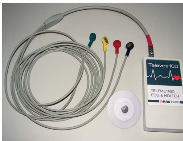
Figure 2. Recording device (Televet 100 ® ) with 4 electrode cables (green, yellow, red and black) and a self-adhesive electrode.

Systems with 4 electrodes are most commonly used. In such a system, the black electrode serves as a reference electrode for the electrocardiograph and can be positioned anywhere on the body surface of the horse. The remaining 3 electrodes are used to construct 3 leads: lead I between the red (right arm, -) and the yellow (left arm, +) electrode, lead II between the red (-) and the green (left foot, +) electrode, and lead III between the yellow (-) and the green (+) electrode (Fregin, 1985). Modern devices will automatically record from all 3 leads at the same time, offering the advantages of a multiple-lead recording. Older devices might require a manual switch between each lead.