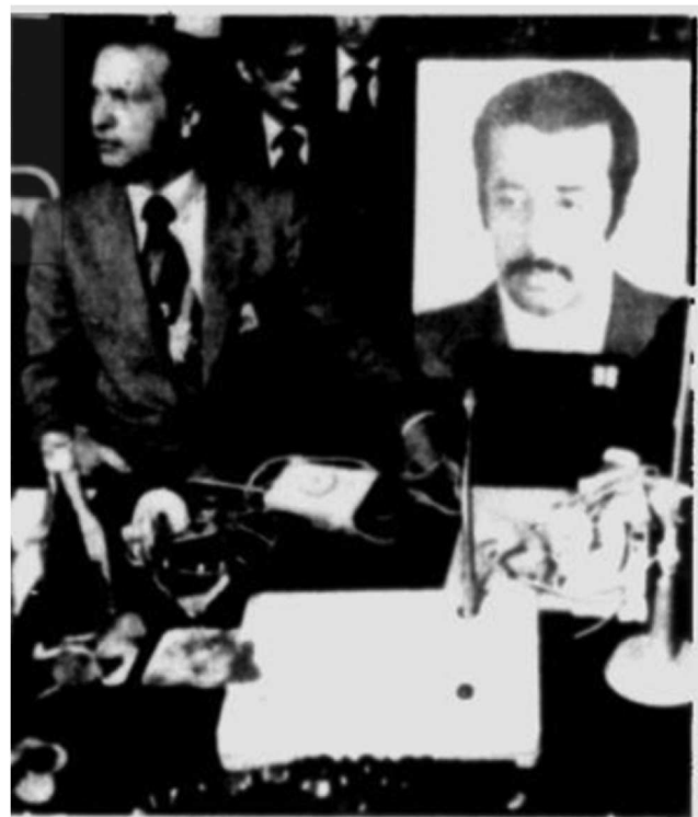
Picture 1. Illustration of OPEC's resilience: The Iranian deputy minister of petroleum, left, sits next to a portrait of the nation's oil minister who was captured by Iraqi troops. The photo was placed on an empty chair during the OPEC meeting of 1980.

Finally, OPEC will not wither away quickly because it still proves useful for its member countries, as is most vividly illustrated by the