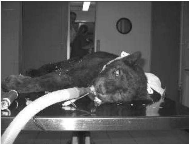
Figure 1. Jaguar in left lateral recumbency after endotracheal intubation in the preparation room.