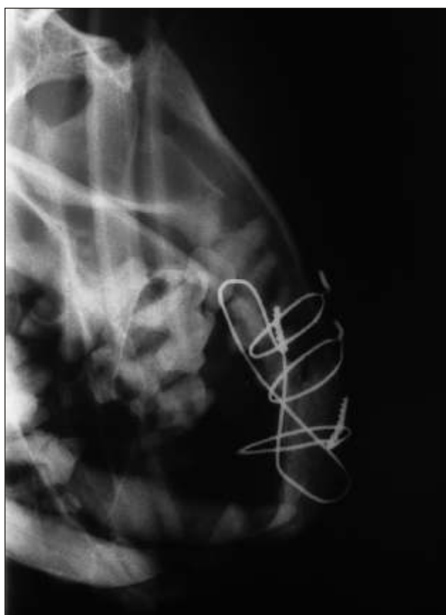
Figure 5. Postoperative radiography (lateral projection).

sic® 0.3 mg/ml, Schering-Plough, Brussels, Belgium) was administered intravenously and the inspiratory fraction of isoflurane was augmented from 0.8 to 1.2 (FiAA %), which resulted in a return to 18 breaths per minute at 100 minutes after intubation. The difference between the FiAA% (0.7-0.8%) and the ETAA% (0.6-0.7%) was stable until the vaporizer was turned higher; 15 minutes later the difference stabilized again at a higher level (1.3-1.4% and 0.9-1.1%, respectively), and remained at this level until the vaporizer was switched off. The tidal volume