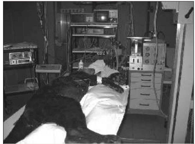
Figure 2. Jaguar in the surgical suite, with the anesthetic monitoring equipment attached; in the middle of the image at the top from left to right: the ECG recorder (Hewlett Packard) and the multi-anesthetic gas analyzer (Capnomac Ultima®, Datex Engstrom Instrumentation Corp.), beneath those the pulse oximeter (Nellcor Puritan Bennett Inc.) and at the right hand side the circle anesthetic machine (Spiromat 656, Dräger, Lübeck, Germany).

General anesthesia was maintained with isoflurane (Isoflo®, Abbott Laboratories Ltd., Queensborough, Kent, United Kingdom) in 1.4 L/min of oxygen using a circle anesthetic system (Spiromat 656, Dräger, Lübeck, Germany) and a precision out-of-circuit vaporizer (Vapor 19,3®, Dräger, Lübeck, Germany) (Figure 1). A 20 gauge