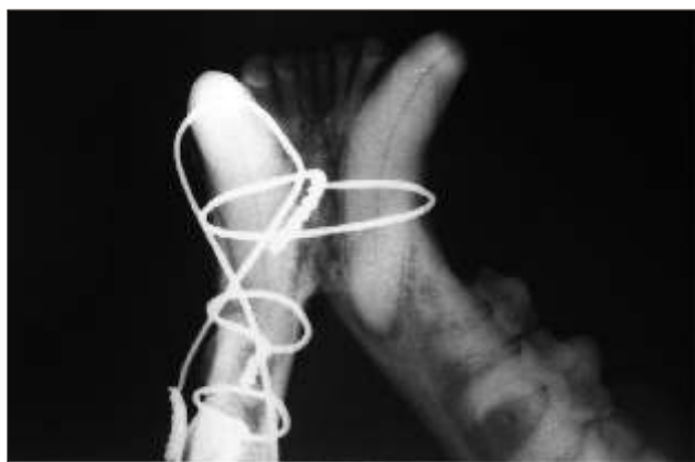
Figure 4. Postoperative radiography (ventrodorsal projection). A good apposition and alignment of the fracture caused by the encircling cerclage wires.