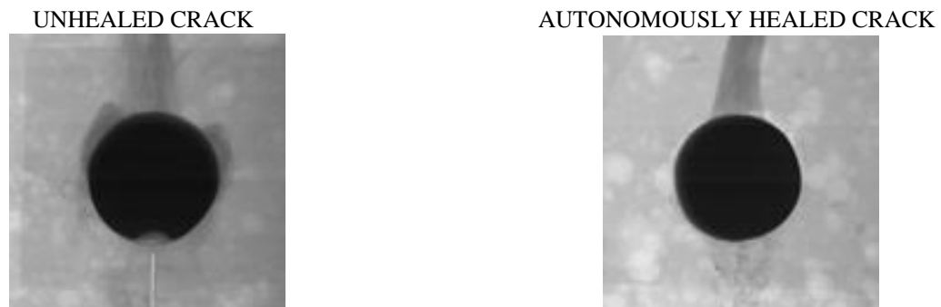
Figure 2: Prevention against pitting corrosion, by self-healing of the crack through release of encapsulated polyurethane, after 30 hours exposure to an acceleration corrosion test