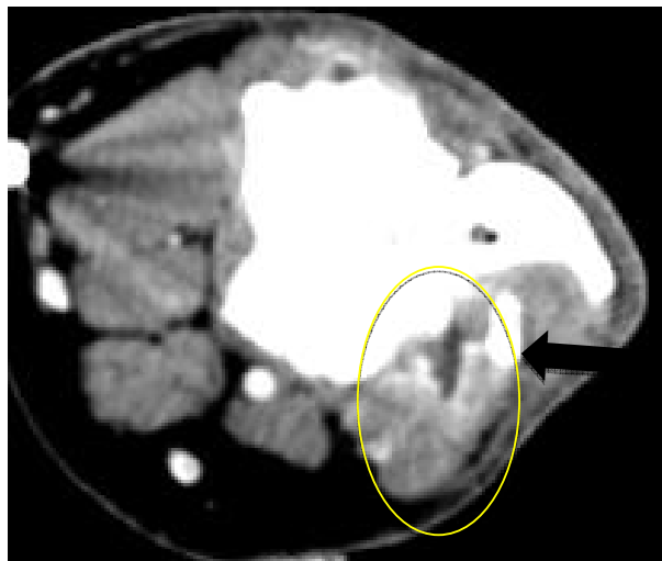
After intravenous injection of contrast medium clear enhancement on the soft tissue CT image is seen within the flexor muscles (yellow circle). The calcification within the flexor muscles can be noticed (black arrow).