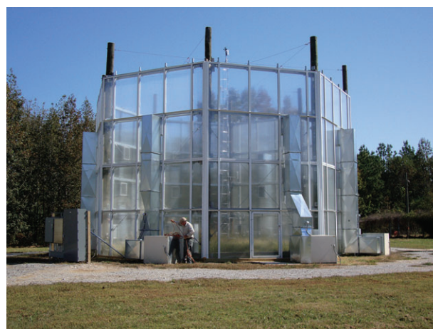
Fig. 1. A prototype warming chamber constructed at Oak Ridge National Laboratory that is being tested for refinement before deployment for an ecosystem manipulation experiment in a spruce – peat bog near Grand Rapids, MN, USA ( https://mnspruce.ornl.gov/ ).

The carbon and nitrogen cycles are especially critical to understanding future climate change and the response and feedbacks of terrestrial ecosystems to future changes (Thornton et al. , 2009). Terrestrial ecosystems that have been identified to be particularly important include tropical forests, boreal forests, peatlands and arctic permafrost. These ecosystems contain large quantities of carbon that if released to the atmosphere as CO 2 or CH 4 could provide significant positive feedback to the climate system and exacerbate global warming. Boreal forests, peatlands and permafrost hold a tremendous quantity of the Earth's buried soil carbon and are especially vulnerable by being in the high latitudes where warming will be highest. In permafrost, the seasonally thawing active layer comprises the top centimetres to meters of permafrost soil and