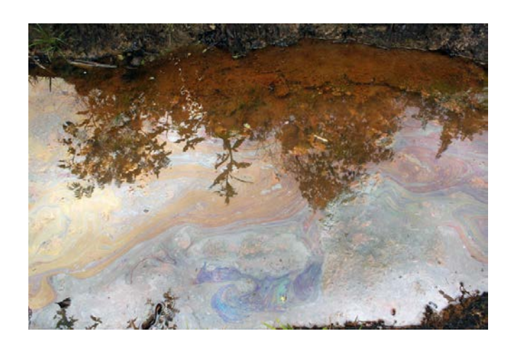
Fig. 6 Oil contamination in the Ecuadorian Amazon