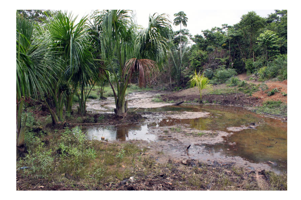
Fig. 1 Oil spill in the Ecuadorian Amazon

The impacts experienced by communities affected by oil extraction, transport and processing (e.g. the refining/chemical industries) are no less dramatic. The loss of control over a people's own territory is one of the first and most harmful consequences of social and cultural disruption. Moreover, the impacts of contamination of local ecosystems tend to exacerbate a decline in economic, and in particular for indigenous people or isolated communities, and food sovereignty. Important health problems related to the oil industry have also been registered, such as the increased incidence of skin, intestinal and respiratory diseases. The deterioration and irreversible contamination of the environment has provoked a shocking number of illnesses amongst local populations (Oilwatch, 2007).