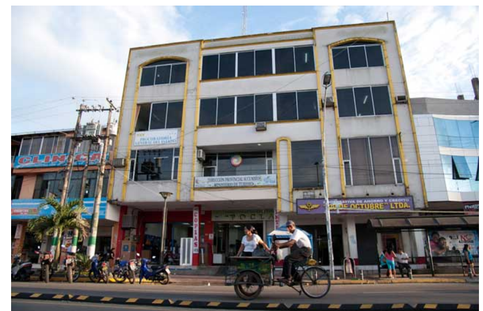
Fig. 7 Lago Agrio Court of Justice

The ruling also highlights the causality between the negligence of risk and the externalisation of negative impacts - population exposure - and the effects on public health and cultural degradation. In this way, the sentence contributed to the enforcement of the precautionary principle in the judicial system. Formidable efforts were made to evaluate different costs - mitigation, restoration, compensation - involving hundreds of experts. The sentence found that the contamination was attributable to Chevron oil activities and, as abusive dumping practices were admitted by TexPet, those threatened by such contingent damages could not remain passive, especially as dumping could have been avoided with the use of other technologies available at that time. TexPet and Chevron-Texaco did not take full responsibility for the activities for which they were accountable, meaning that local inhabitants had a clear and legitimate claim for justice for the damage suffered (Pigrau et al, 2012). Of interest too is the doubling of the penalty in the case of non-excuse. This part of the sentence acknowledges of the value of the dignity of the people affected, and the need to restore this dignity (just as importantly the spoilt environment requires remediation) by means of an apology.