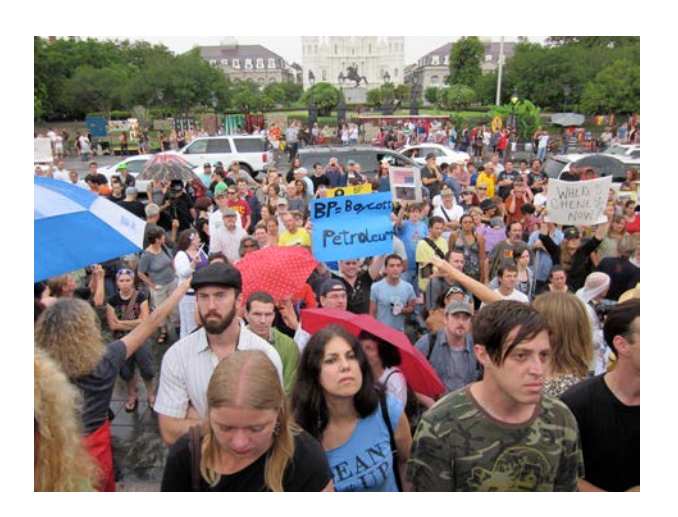
Fig. 8 March against BP in New Orleans

Hundreds of lawsuits against the companies involved have been registered since the accident. In August 2010, the US Judicial Panel on Multidistrict Litigation consolidated 77 lawsuits initiated by individuals, groups of citizens and businesses for economic loss, environmental damage, wrongful death and personal injury to be tried in the U.S. District Court of the Eastern District of Louisiana, New Orleans presided by Judge Barbier. The first hearings saw complaints for personal injuries and death, private and individual business loss, economic loss for livelihood, clean-up, public damages, chemical exposure and property damage, injunctive and regulatory actions. After these hearings it was decided plaintiffs could file 'master' complaints until December 2010. By that time, three master complaints were presented, one on private economic loss and property damage, one on chemical exposure and property damage and one on injunctive and regulatory claims against private parties involved in the accident (Eastern District Court of Louisiana, 2013).