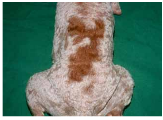
Figure 5. Presentation of canine recurrent flank alopecia without noticeable alopecia. Note the difference in coat color in an irregular pattern in the thoracolumbar area in this Poodle.

gested (Paradis, 2009). However, the hypopigmentation bordered by the hyperpigmentation is unique to erythema ab igne (Declercq and Vanstapel, 1998). Moreover, histopathological changes typical of erythema ab igne, such as keratinocyte atypia and karyomegaly and a variable number of wavy eosinophilic elastic fibres ("red spaghetti"), are not seen in CRFA with interface dermatitis (Declercq and Vanstapel, 1998; Walder and Hargis, 2002; Rachid et al., 2003; Mauldin, 2005).