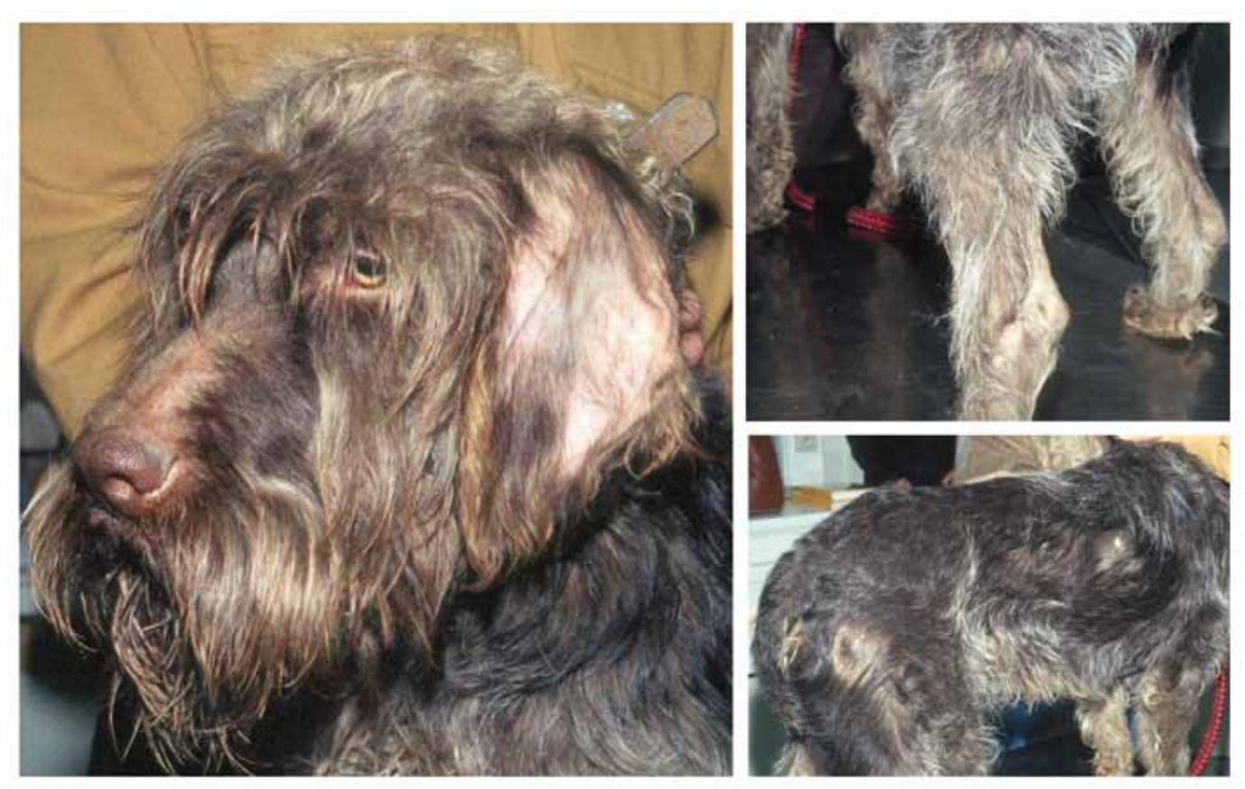
Figure 4. Generalized presentation of canine recurrent flank alopecia in a Wirehaired pointer. Note alopecia of the pinnae, flanks and distal extremities.

by White et al. (1992), the onset of the discoloration of the coat from silver or black hairs turning into a gold colored coat occurred during the months of April till September. This is later than what has been observed in the other forms of flank alopecia. One of the Schnauzers had two consecutive episodes of aurotrichia (White et al., 1992). Idiopathic aurotrichia has also been described in a Bichon frisé (month of onset not reported) (Miller et al., 2013b). The authors of the present study have seen recurrent aurotrichia in a Poodle, Lhasa apso, Cocker and Yorkshire terrier during the months of April till September (Figure 5). It is currently unknown why the coat color change of these dogs occurs at that time of the year. Possibly, the changes in the hair coat represent the recovery phase of the disease and are actually new grown hairs.