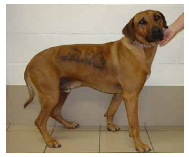
Figure 1. Classical presentation of canine recurrent flank alopecia. A four-year-old Rhodesian ridgeback with bilateral symmetrical, geographic shaped alopecia on the thoracolumbar area and marked lesional hyperpigmentation.