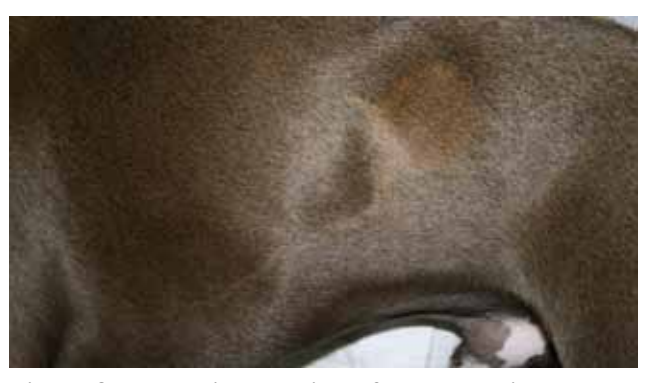
Figure 8. Focal discoloration of the coat with concurrent atrophy of the skin in a Weimaraner caused by a glucocorticosteroid injection.

Erythema ab igne is a typically unilateral dermatosis that occurs at the site of repeated exposure to moderate heat. Lesions are commonly seen at the dorsolateral thoracic region and consist of irregular branching areas of alopecia with erythema and hypopigmentation bordered by hyperpigmentation (Miller et al., 2013d; Gross et al., 2005b; Walder and Hargis, 2002; Declercq and Vanstapel, 1998) (Figure 7). The distribution of the lesions and the irregular alopecia are similar to CRFA, especially flank alopecia with interface dermatitis. The hypopigmentation bordered by the hyperpigmentation is unique to erythema ab igne (Declercq and Vanstapel, 1998). Histopathological changes consist of keratinocyte atypia and karyomegaly, scattered apoptotic or vacuolated basal cells with an interface dermatitis, adnexal atrophy and a variable number of waxy eosinophilic elastic fibres ("red spaghetti") (Gross et al., 2005b). Erythema ab igne is diagnosed by a history of chronic access to