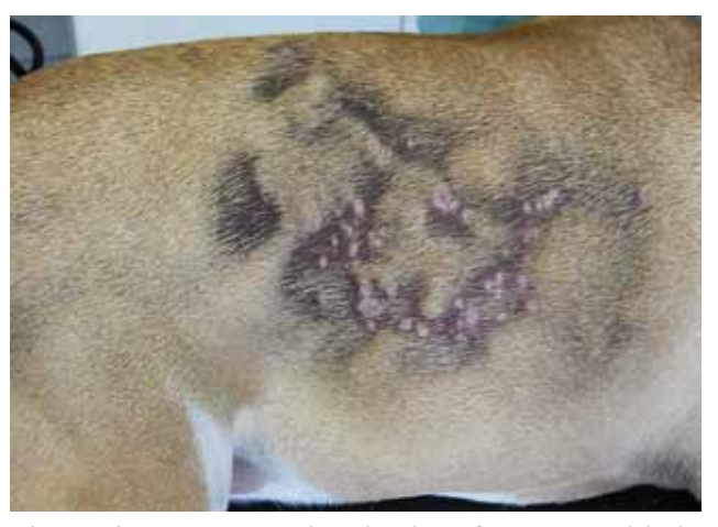
Figure 6. Flank alopecia with interface dermatitis in a 3-year-old English bulldog. Note the thoracolumbar distribution of the lesions with the presence of crusted depigmented plaques within the alopecic area (Picture courtesy of Anja Bonte).

It is of interest that certain breeds that are predisposed for CRFA, such as the Boxer, Airedale and German pointers, are also predisposed for hypothyroidism (Dixon et al., 1999; Paradis, 2009). Hypothyroidism usually presents as a slowly progressive alopecia, as opposed to the rapid onset of alopecia in CRFA. Usually, other coat changes are present in hypothyroid dogs such as a scaly or dull and brittle hair coat. Concurrent pyoderma and otitis are an occasional complaint in hypothyroid dogs (Paradis, 2009). Slow hair regrowth in clipped areas and a rat tail are other clinical findings suggestive of hypothyroidism.