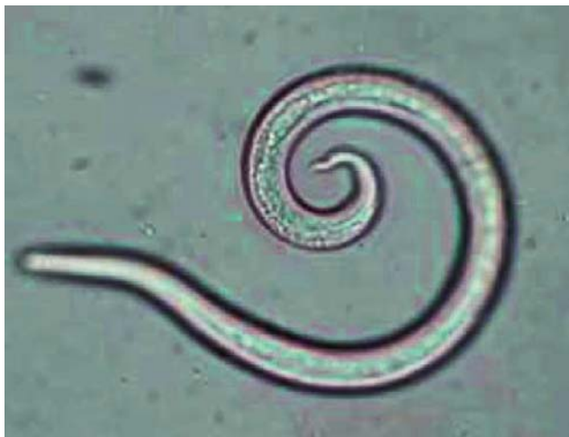
Figure 2. First stage larva (L1) visualized by light microscopy, the kinked tail with dorsal notch is the primary diagnostic feature.

by passive sedimentation in the Baermann funnel, which takes 24 to 36 hours and makes this test time consuming. More importantly, several authors have reported a negative Baermann test in dogs with angiostrongylosis (Denk et al. , 2008). During the long prepatent period, animals can display symptoms, but the larvae cannot yet be detected in the faeces. Moreover, the excretion of larvae is intermittent and variable. For this reason, it is advisable to collect faecal samples over a period of three consecutive days. A negative Baermann result does not exclude infection in a dog with typical symptoms living in a high-risk environment (Traversa and Guglielmini, 2008; Helm et al. , 2010).