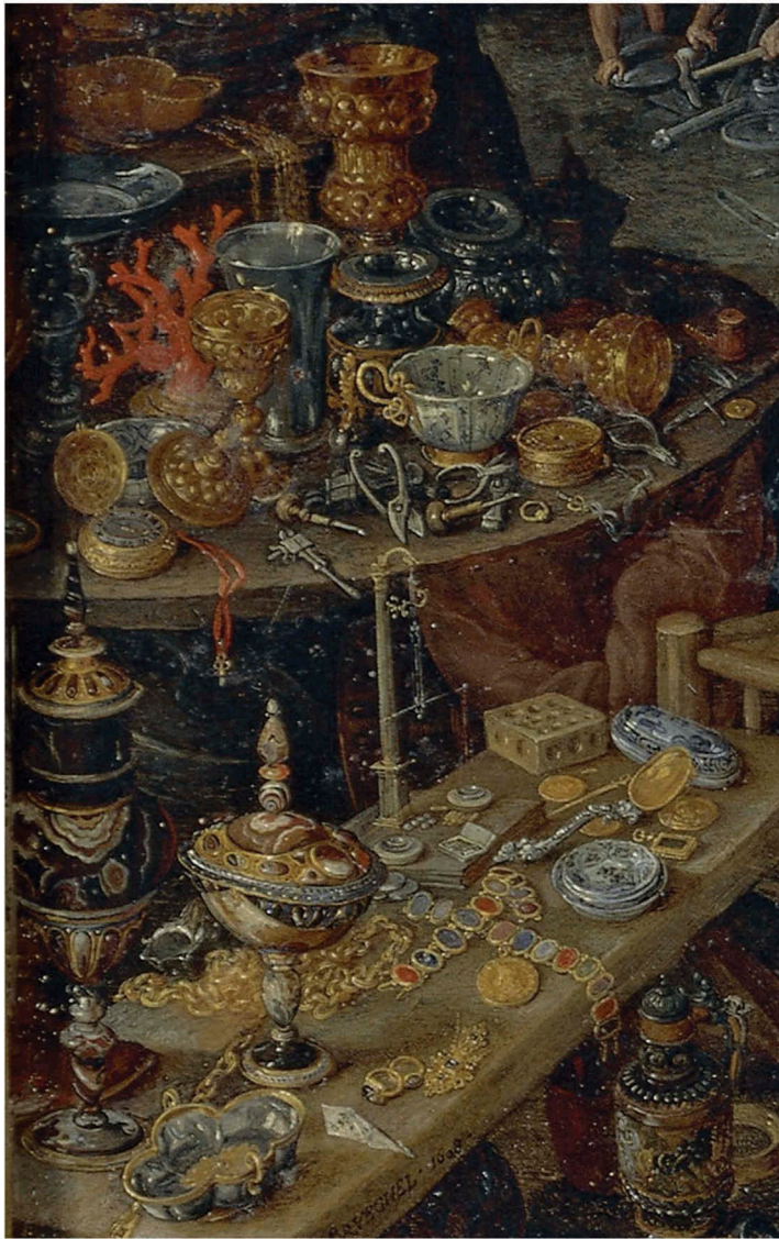
Figure 4. (Continued).

of Minerva, who was so angry with the beautiful Medusa that she punished her by turning Medusa into an evil creature that petrified anyone who looked her in the eyes. When Perseus later beheaded Medusa, he took her head as a trophy with him. When the hero laid down the head of Medusa on a beach, some of her blood came into contact with seaweed, whereupon it was petrified into red coral. Sea nymphs marvelled, took the coral and spread it over the seas of the world. 51