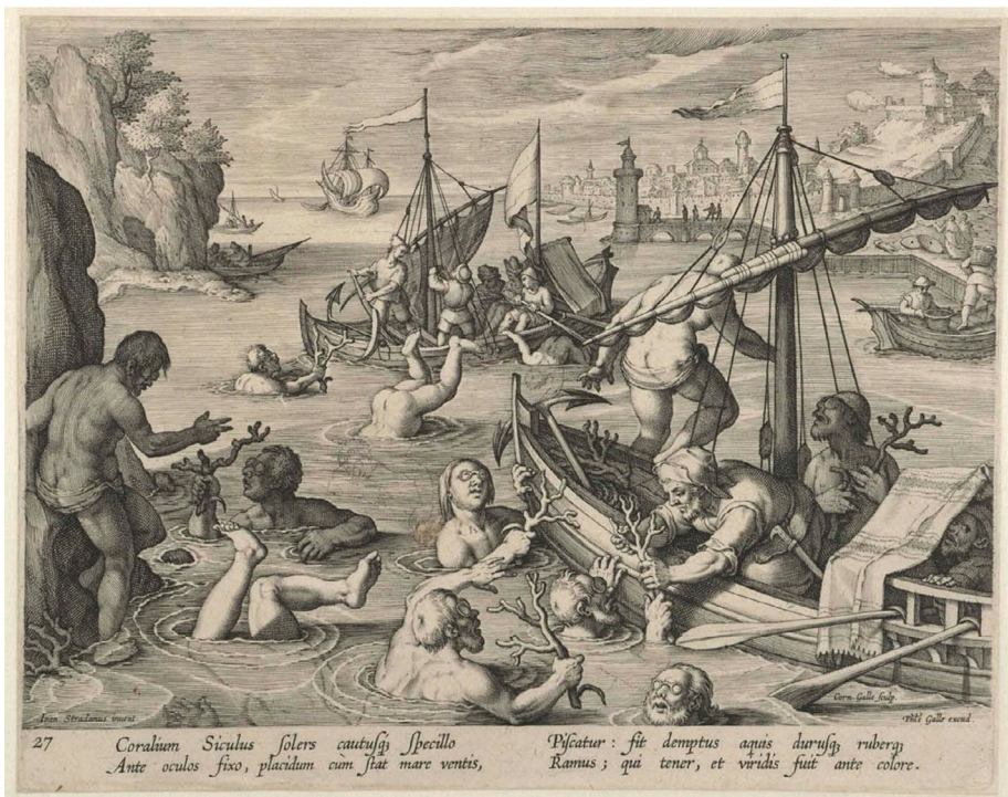
Figure 2. Joannes Stradanus and Philips Galle, Diving for coral (on Sicily) . Venationes ferarum, avium, piscium , plate 92 (Antwerp 1596 [first published: 1578]).

In the late sixteenth century, Philips Galle (1537–1612) published a print depicting the diving for coral in Sicily (Figure 2). It was part of the series Venationes ferarum , after