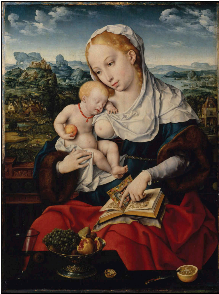
Figure 5. Joos van Cleve (and a collaborator), Virgin and Child , c. 1525. Oil on panel, 72.1 × 54 cm, Metropolitan Museum of Art, New York.