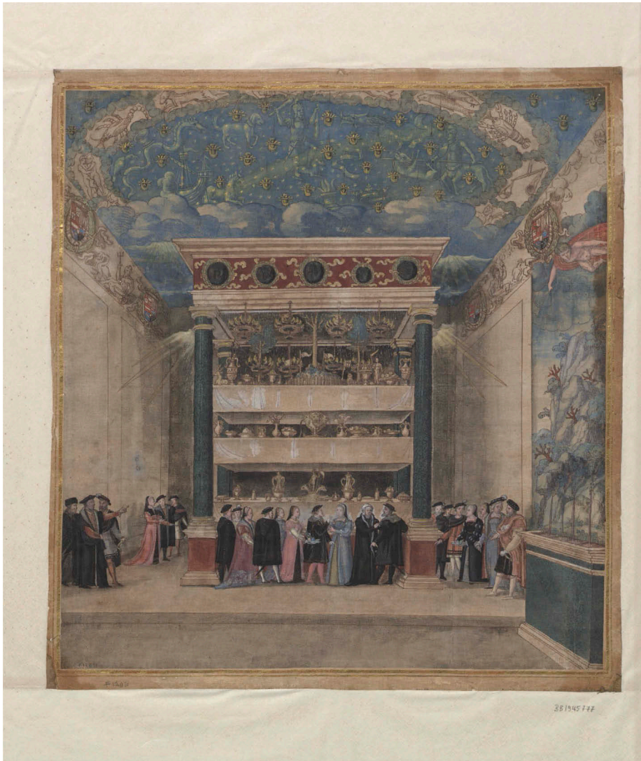
Figure 9. Anonymous, Interior of the castle Binche during the celebration for Philip II: The enchanted room , 1549. Ink on paper, 40.9 × 38.7 cm, Royal Library Brussels (F12931 plano C).

relation to the debates about images of stone, as well as in relation to coral in particular. First, as pointed out, coral was associated with the Blood of Christ and His suffering. More specifically, the transformation process that is petrification implied that things could last forever. Coral might die because of petrification; it also became a piece of immortal life. 99 Death and immortality at the same time: a perfect analogue for the sacrifice of Christ and the salvation waiting upon true Christians.