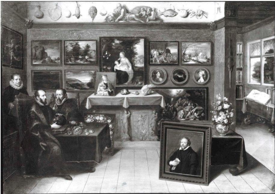
Figure 6. Frans II Francken, detail: A collector's cabinet with Abraham Ortelius and Justus Lipsius , 1617 (inscribed and dated), Oil on canvas transferred from panel, 52.5 × 73.5 cm. Private collection (auctioned 2011, Haboldt & Co.).

On a gallery picture by Frans Francken, the painter has depicted an imagined conversation between Abraham Ortelius and Justus Lipsius (Figure 6). 70 In this painting, a piece of coral is pinned to the upper back wall, amidst dried animals. The coral and dried sea creatures are positioned in line with a statuette of a river god, who in