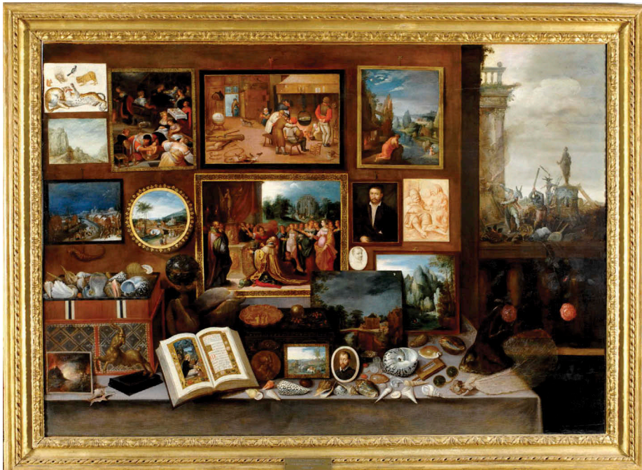
Figure 1. Frans II Francken, Interior of an art cabinet with 'ânes iconoclastes' , 1620 or 1626. Oil on panel, 101 × 143 cm, Quadreria della Società Economica di Chiavari.

In the painted image shells are scattered on the table next to a fine-grained piece of coral and a dried fish. An open book of hours leans against a lacquer box with a marble ball on top, while further to the left another lacquer box is filled with an assortment of shells. Paintings and drawings cover the wall behind the table. The tranquil scene of material objects is like a snapshot; an arrangement of objects that could have been slightly different just a moment before and might easily change in a moment after. The display of objects and images suggests the presence of human activity, yet there is no one to be seen in the room. In sharp contrast to the tranquility of room is the vista to the outside world, where men with donkey heads are destroying objects and images. 1