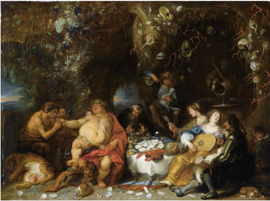
Figure 8. Simon de Vos, Bacchanal in Grotto , 1634. Oil on panel, 53.2 × 72,5 cm, private collection.

Banquets of the gods were widely collected in Antwerp, as we know from inventories and surviving examples. 94 Also popular were depictions of a feasting Bacchus, such as Simon de Vos' Bacchanal in a grotto of 1634 (Figure 8), the coral seems to grow directly out of the stony sides of the cave, just as do all sorts of shells. Unlike the transformation processes wrought by hard working artisans in Breughel's work (Figure 5), the painting by De Vos seems to refer to metamorphoses in an indirect manner. We see grapes and wine (and drunkenness), but also an allegory of the ages of man. The metamorphosis related to coral and shells may be seen in light of the debate on petrification.