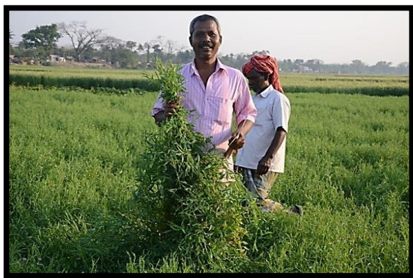
Farmer in grasspea field at Murshidabad (WB)

Despite all these merits, grasspea has an ambivalent reputation. Its seed contains a toxin, Beta-ODAP ( \beta -N-oxalyl-L- \alpha , \beta -diaminopropionic acid), which causes neuro-lathyrism a “nutritional curse” if consumed in excessive quantities for a long period of 4 to 5 months continuously. Grasspea is largely being used as adulterant with other pulses; therefore cultivation of low-ODAP or ODAP-free cultivars is highly desirable. In this endeavour, low-toxin (<0.1%) grasspea varieties with higher yield having desirable attributes like disease and pest resistance along with matching production technologies have been developed by various Indian institutions and ICARDA.