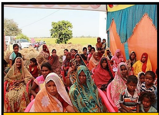
Women's training for removal of toxin from grasspea

Despite all these merits, grasspea has an ambivalent reputation. Its seed contains a toxin, Beta-ODAP ( \beta -N-oxalyl-L- \alpha , \beta -diaminopropionic acid), which causes neuro-lathyrism a “nutritional curse” if consumed in excessive quantities for a long period of 4 to 5 months continuously. Grasspea is largely being used as adulterant with other pulses; therefore cultivation of low-ODAP or ODAP-free cultivars is highly desirable. In this endeavour, low-toxin (<0.1%) grasspea varieties with higher yield having desirable attributes like disease and pest resistance along with matching production technologies have been developed by various Indian institutions and ICARDA.