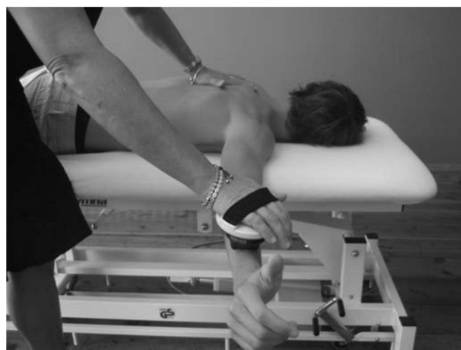
Figure 3 Manual muscle testing of the middle trapezius. Written consent from the patient and his legal guardian was obtained for publication of the image in print and online.

force at the lateral aspect of the radius in downward direction (figure 4).