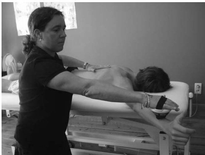
Figure 4 Manual muscle testing of the lower trapezius. Written consent from the patient and his legal guardian was obtained for publication of the image in print and online.