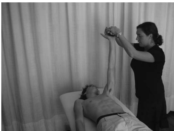
Figure 5 Manual muscle testing of the serratus anterior. Written consent from the patient and his legal guardian was obtained for publication of the image in print and online.