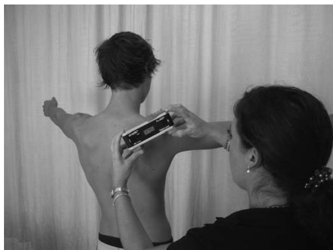
Figure 1 Scapular upward rotation measurement in 90° of scapular elevation. Written consent from the patient and his legal guardian was obtained for publication of the image in print and online.

For the LT strength measurement, the shoulder was placed into 145° of abduction with full external rotation. Subjects were asked to lift up their arm, and the examiner applied