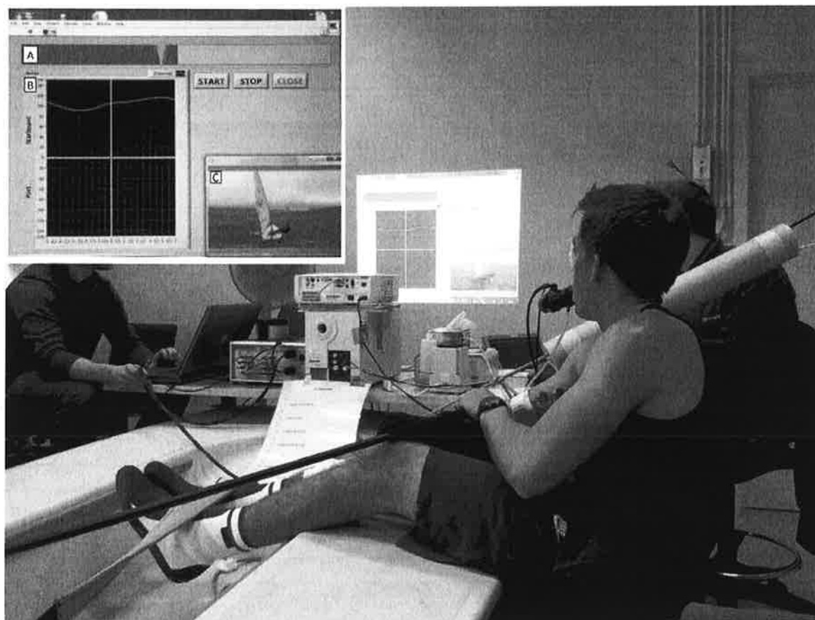
Figure 2 — Instruction screen, consisting of (A) a biofeedback system (indicates the resultant of the required hiking moment [HM] – produced HM), (B) an anticipation system (indicates whether the required HM will increase or decrease), and (C) a synchronized upwind sailing video (to make the laboratory test more lifelike). The goal for the sailor is to keep the arrow in the biofeedback system as long and as close as possible to the center of the bicolored beam.

combination and averaged during 10-second intervals (Jaeger Oxycon Pro, Höchberg, Germany). 16 Before each test, the gas analyzers and volume transducer were calibrated. HR was measured with a Polar RS400 (at 5-s intervals). After each 3-minute step, including pre and post, a blood sample was taken to measure [La] (Analox GM7; Analox Instruments Ltd, London, UK). Peak power output, VO_{2peak} , V_{Epeak} , RER_{peak} , and HR_{peak} were determined as the highest during an interval of 30 seconds 16 when at least 1 of the following criteria 17 was met: VO_2 leveling off, RER > 1.10 , HR > theoretical predicted maximal heart rate ( [220 - \text{age}] \pm 10 beats/min), or [La] > 8 mmol/L. [La]_{peak} was determined for every subject as the highest value seen throughout the protocol. For each subject, the theoretical anaerobic 4-mmol/L threshold ( AT_4 ) was determined. Power output, VO_2 , and HR at AT_4 were determined. The results from the ICT are displayed in Table 1.