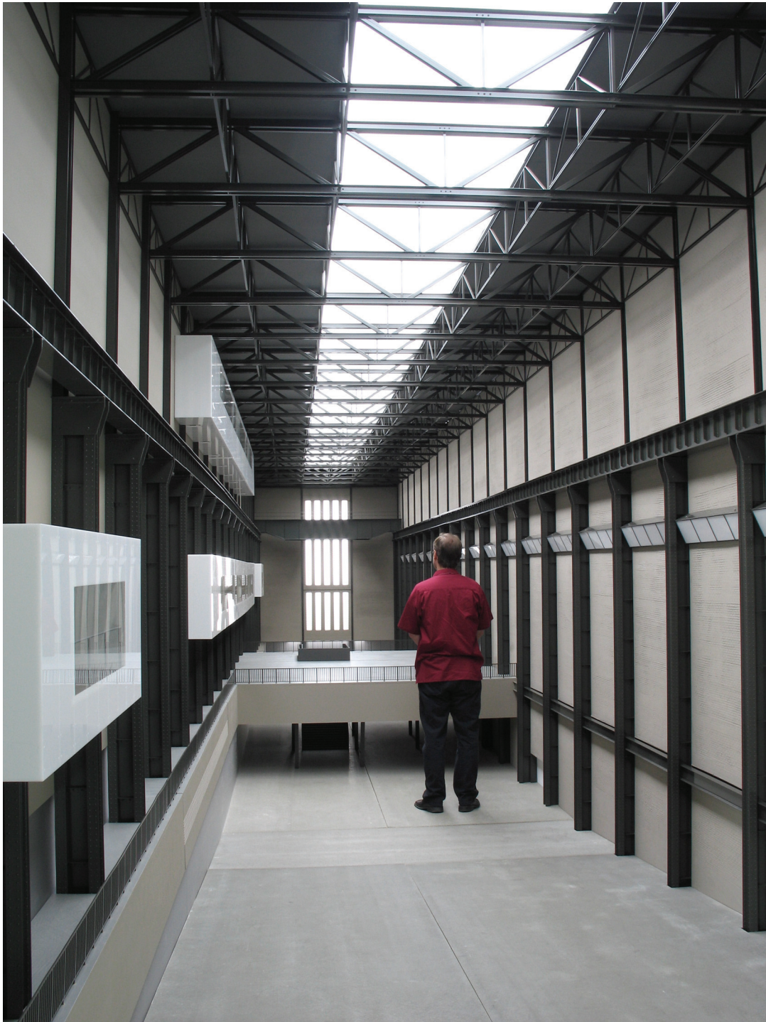
Fig. 1: Roman Ondák, 'It Will All Turnout Right in the End', 2005–2006 (Installation, mixed media; Overall dimensions 3,6 x 2,5 x 15,8 m), Installation view, Tate Modern, London, 2006. Courtesy the artist, Gallery Martin Janda and gb agency, Paris. © Roman Ondák.