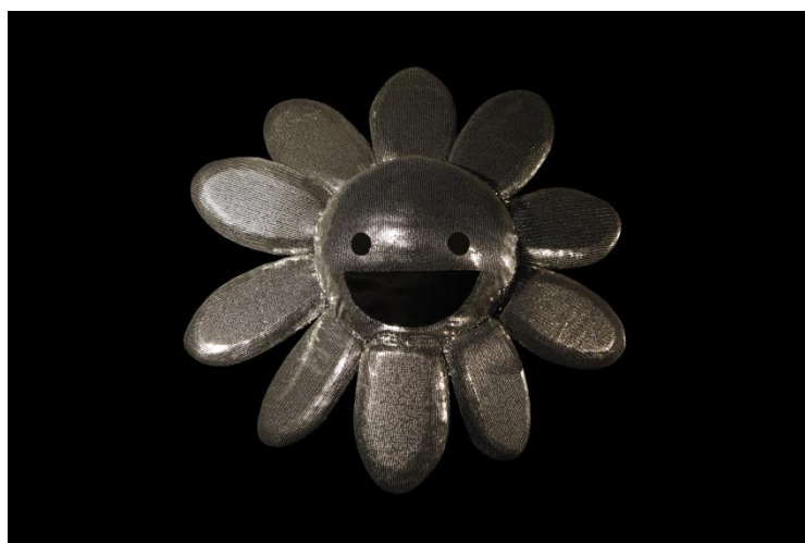
Kris Verdonck / A Two Dogs Company- Untitled

seems to tell us. The mascot in Untitled is the synthesis of the hologram's dematerialized image of the human and the material performing nonhuman machines: it is the material image, reminding of Guy Debord's assertion that The