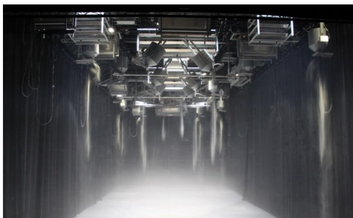
Romeo Castellucci - Le Sacre du Printemps

Another performance referring to the dance-tradition is Romeo Castellucci's Sacre du printemps (rite of spring). I would like to present this performance as