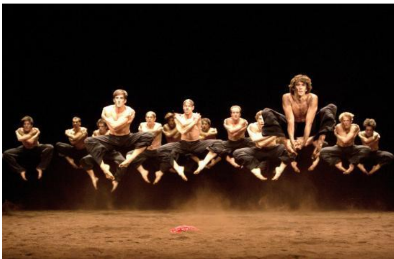
Pina Bausch - Sacre du Printemps

printemps from 1975, in which brown earth lay on stage and created upward clouds in reaction with the dancers' movements. Instead of the dust moving upwards, here it comes down, in this way