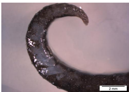
Fig. 1 : White discolored necrotic tail in a seahorse