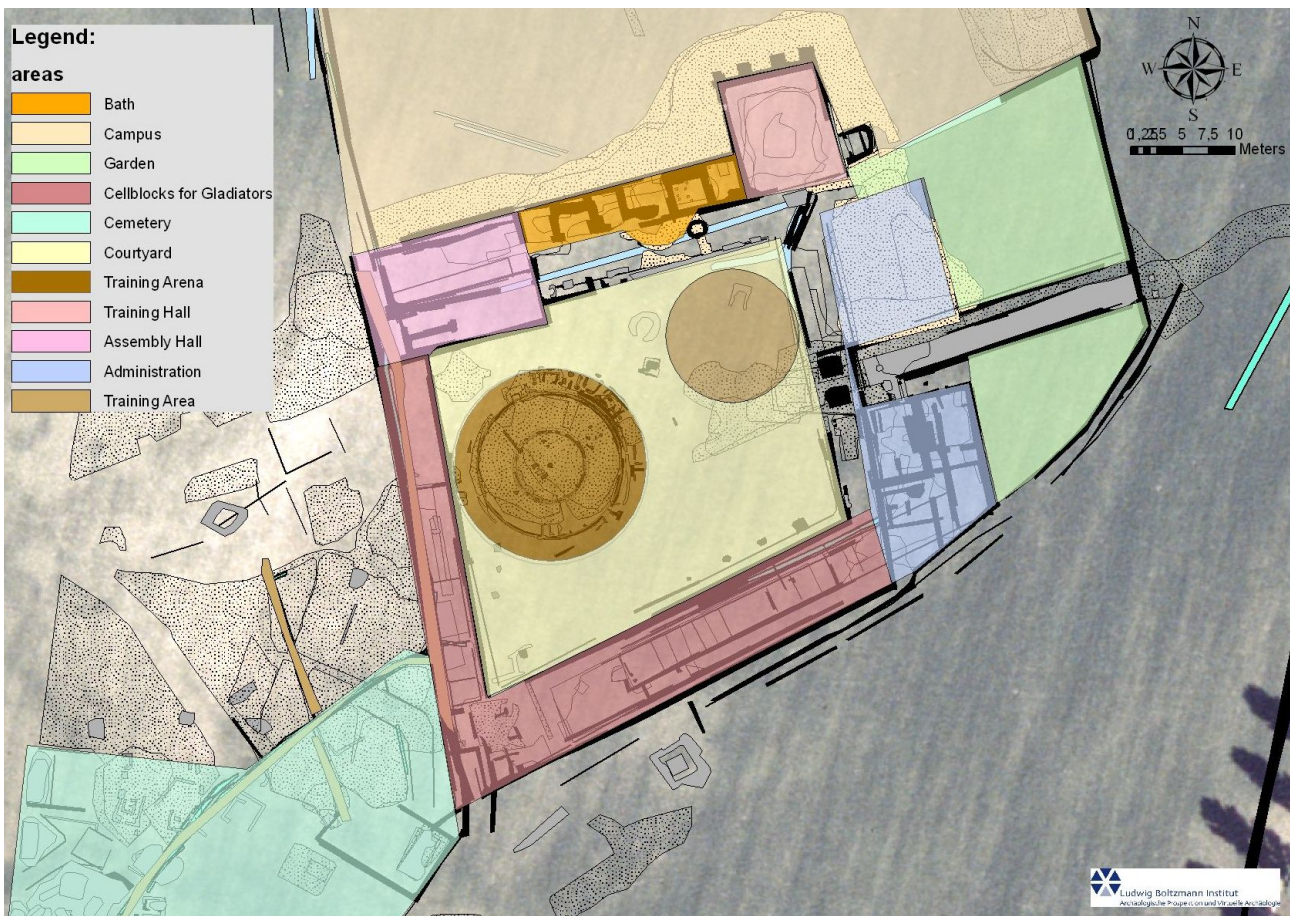
Figure 3: 3D interpretation of the magnetic and GPR prospection data (top) and plan view presentation (bottom).