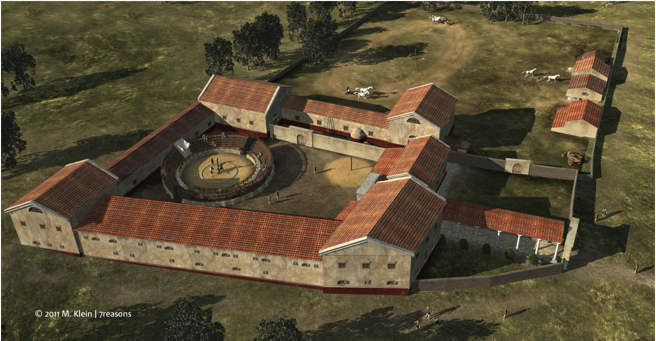
Figure 4: Virtual reconstruction of the school of gladiators.

following the latest multidisciplinary, entirely non-invasive and hence archaeologically sustainable, non-destructive, prospection approach promoted by the LBI ArchPro. During the 19 th century, Carnuntum was called the “Pompeii at the doors of Vienna” due to the good preservation of the Roman ruins. Since then, the situation has changed drastically. Both aerial photography and geophysical data show that the archaeological heritage has suffered severe damage.