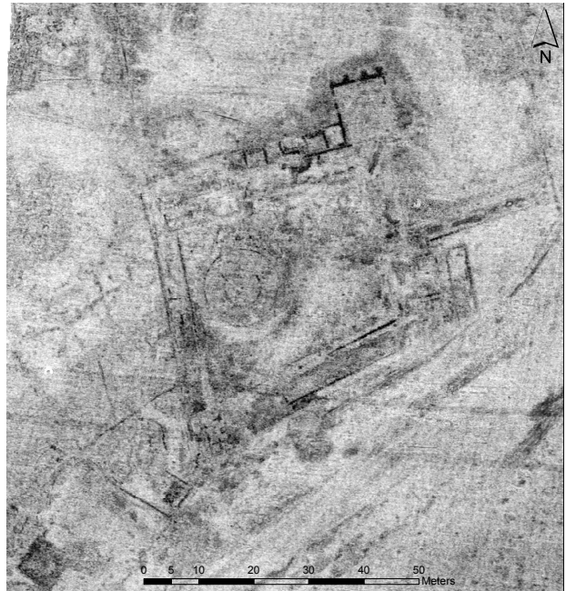
Figure 2: GPR depth-slice of the high-definition GPR data acquired with the MIRA system from ca. 60 cm depth. Note the point-anomaly belonging to the pole that presumably had been placed in the centre of the training arena.

second century AD and was modified many times during later phases, as excavations in 1923–1930 showed. The Roman amphitheatre, hosting up to 13,000 spectators, was credited by contemporary inscriptions to have been the fourth largest amphitheatre in the Roman Empire. It was intensively used for gladiatorial games, as documented and illustrated by many finds. Despite the earlier excavations, the surroundings of the amphitheatre were mostly terra incognita. First indications on significant structures around the amphitheatre came from aerial photographs showing a main Roman road leading towards it from the town, with shops and tabernae towards its eastern side. In the west, however, no structures at all were visible.