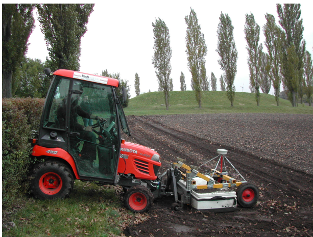
Figure 1: The 16-channel 400 MHz MALÅ Imaging Radar Array surveying the field containing the school of gladiators. In the background some of the remains of Carnuntum's western amphitheatre can be seen.

The western amphitheatre south of the civil town was erected outside of the Roman Civil Town in the first half of the