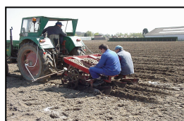
Fig. 1: Certified seed of Bintje was planted on the 27th of April