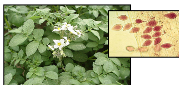
Fig. 2: Plants from two 2 middle rows were artificially infected by P. infestans .