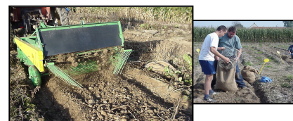
Fig. 3: Tubers were harvested on 20 September.