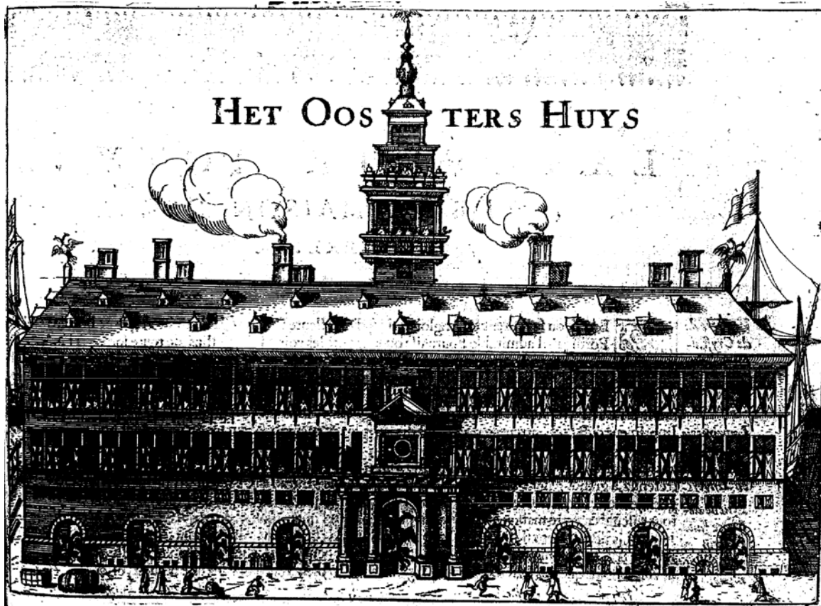
Figure 2: The Oosters Huys or Hansa house, Guicciardini, Description, (edition 1641)

The text continues with a list of outstanding buildings, such as the meat hall, the tapistry hall, the Hansa-house and others. This section is introduced with an interesting comment on the high housing prices in the city: the town contains more than 13500 houses, and there is space for ca. 1500 more. But although being thus one of the most populous and best built towns of Europe, the high frequency of people makes that housing prices are the highest Guicciardini had seen in any other town except in Lisbon. 14 The town hall, the major public building serves as a frame for the description of the privileges and the governmental structures of the city. The rise of Antwerp to its present privileged status is explained in three subsequent stages. First, the establishment of the Brabant fairs, which attracted international trade already from the late Middle Ages on. Second, the fact that in 1503 or 1504, the Portuguese reached the Indian Ocean and imported spices and other oriental goods, which had before been imported via the Red Sea, Beirut, Alexandria and Venice, and distributed them via Antwerp. This attracted in its turn Southern Germans and after 1516 the rest