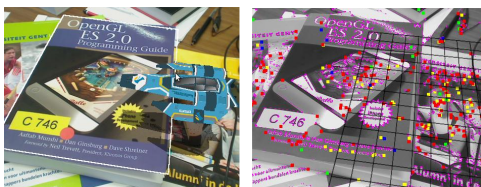
Figure 2: The augmented reality application tracks feature points in the video frames (right) to enable the overlay of 3D objects (left).

These components are implemented based on the source code of [2]. The resulting application is shown in Figure 2. On the right a grayscale video frame is shown with the tracked feature points, from which the camera position is estimated. The left shows the resulting overlay with a 3D object.