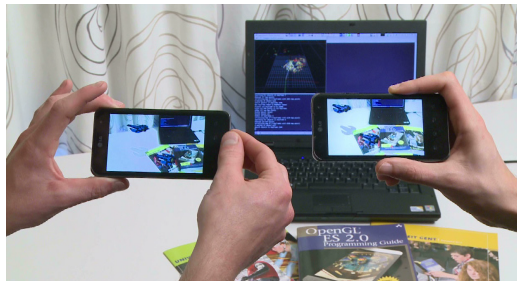
Figure 3: Collaborative PTAM on two mobile devices: the map is updated and refined on the laptop with keyframes from the two devices. Both devices track the map and render the shared scene graph.

To get such a setup, the Mapper component is deployed on a laptop connected to multiple mobile devices via WiFi. All users have a device running a VideoSource, Renderer, Controller, Tracker and Relocalizer component, and connect to the laptop running the Mapper and Model components as shown in Figure 3.