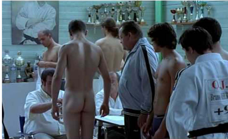
Figure 5: Typical scene during a jūdō weigh-in with some young jūdōka completely nude, while having little or no privacy, and oftentimes with coaches from other teams present as well as other jūdōka waiting to be weighed, and unnecessary officials potentially gratifying voyeuristic desires under the veil of fulfilling some official duty. Scene depicted taken from the French movie Douches Froides [Cold Showers].