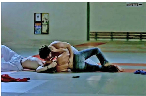
Figure 7: The infamous dōjō ménage-à-trois scene from the 2005 French jūdō movie Douches Froides [Cold Showers].