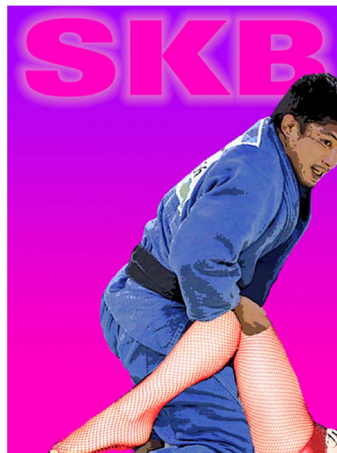
Figure 1: Poster featuring 2004 and 2008 double Olympic champion (-66 kg) Uchishiba Masato 内柴正人 in a compromising pose alluding to his arrest and subsequent conviction for rape of a female member of the Kyūshū University's jūdō team. The letters 'SKB' in the background refer to the Japanese word sukebei 助平 is Japanese and means 'lecher' or 'pervert'.

Improper touching in locker rooms, showers and saunas have also been reported. It is in this context that we have coined the term jūdō sukebei 柔道助平 [" jūdō lecher " or " jūdō pervert "]. The word sukebei 助平 is Japanese and means 'lecher' or 'pervert'. A jūdō sukebei , hence, is a person (male or female, though usually of the male gender) who under the pretense of engaging in jūdō and associated activities, seeks out situations to satisfy socially unacceptable sexual practices sexual desires, paraphilias or similar socially unacceptable sexual behaviors generally without the consent of the other(s), or, potentially involving minors (Figure 1).