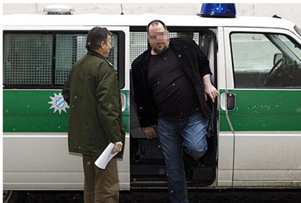
Figure 3: German sex offender Wolfgang Doffek found guilty in 2010 by the Passau District Court of multiple incidents of sexual abuse of children and sentenced to 6 years and 9 months in prison, and subsequent psychiatric confinement.

On January 8 th of 2010 the Landgericht (District Court) Passau found Doffek guilty of multiple incidents of sexual abuse of children and sentenced him to 6 years and 9 months in prison (Anonymous, 2010) (Figure 3). Because Doffek was considered a high-risk pedophile with likely recurrence and little chance of recovery, he was also sentenced to indefinite psychiatric internment. Not only the German jūdō world but the entire German sports world is shocked by the duration and extent of the abuse and several committees are formed to discuss and implement new measures to prevent such criminal behavior from reoccurring and from going on undetected (Laufer, 2011).