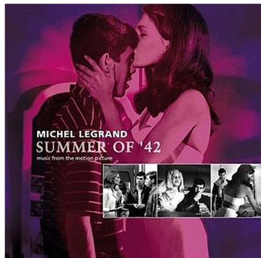
Figure 4: Movie poster of Michelle Legrand's Summer of '42 a film which famously portrayed the romance of a 15-year old boy with an adult woman, which was widely applauded back in 1971.

Apart from the problem that age of consent is not universal across states, nations and cultures it even is not constant within the same country or culture. For example, the 1971 movie Summer of '42 became the sixth highest-grossing film of that year and one of the most successful films in history with an expense-to-profit ration of 1:32 and with an additional estimated more than $20 million from subsequent video rentals and purchases (Figure 4). The film also attracted wide acclaim after being broadcast on major television channels across the world. Furthermore, the book became one of the best selling novels of the first half of the 1970s, requiring 23 reprints between 1971 and 1974 to keep up with customer demand (Anonymous, 2002).