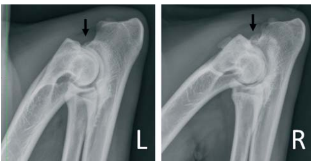
Figure 2. Radiography of both elbow joints: mediolateral flexion view. Left elbow (L): small amount of new bone formation at the anconeal process (arrow). Right elbow (R): large amount of new bone formation at the anconeal process (arrow) and at the cranial part of the radial head.