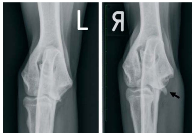
Figure 3. Radiography of both elbow joints: craniocaudal view. The right elbow shows an osteophyte (arrow) and flattening of the medial part of the humeral condyle.

Arthroscopy of both elbows was performed via a medial approach of the joints (Van Ryssen et al. , 1993). Inspection of the right elbow revealed moderate synovitis, mild incongruity and smooth white cartilage in the lateral part of the joint. Pathologic findings