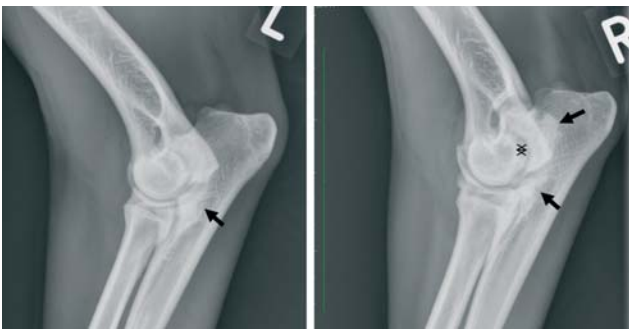
Figure 1. Radiography of both elbow joints: mediolateral extension view. Left elbow (L): mild radiolucency of the medial coronoid process and moderate osteosclerosis (arrow). Right elbow (R): radiolucent and irregular medial coronoid process and severe osteosclerosis (arrows). Increased width of the joint space at the level of the ulnar trochlear notch (double-headed arrow), indicative for mild incongruity of the elbow joint.

A 10-month-old, male Large Munsterlander was presented with lameness of the right forelimb for already five months. According to the owner, the lameness started bilaterally, but progressed to right forelimb lameness. The dog was first diagnosed with panosteitis by the local veterinarian and was treated with meloxicam (Metacam®, Boehringer Ingelheim Vetmedica) during two weeks. This resulted in a temporary improvement. The dog was meant to become a sporting dog.