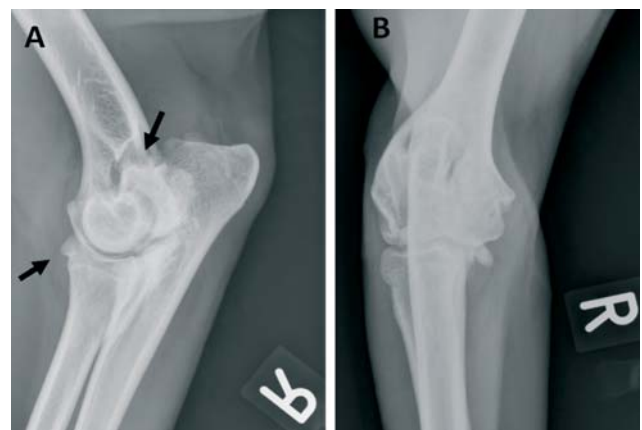
Figure 6. Radiography of the right elbow joint: medio-lateral extension (A) and craniocaudal view (B), five months after arthroscopic treatment and three months after ACP treatment: a mild increase of the osteoarthrititis is visible (arrows).

of the medial coronoid process were a small, slightly elevated osteochondral fragment (5 x 3 mm) and erosion of the cranial part of the medial coronoid process (Figure 4a). Pathologic findings of the medial aspect of the humeral condyle were a small fibrocartilagenous flap (3 x 3 mm) and complete erosion of the medial part of the humeral condyle. There was a sharp delineation between the lateral and the medial joint space (Figure 4b). The coronoid fragment was removed with a hand burr, curette and grasping forceps (2 mm diameter instruments, R. Wolf, Knittlingen, Germany). The fibrocartilagenous flap was removed and the subchondral bone was curetted until a bleeding surface appeared (Figure 4c). Arthroscopy of the left elbow revealed mild synovitis and a non-displaced medial coronoid fragment surrounded by a fissure (Figure 5). The car-