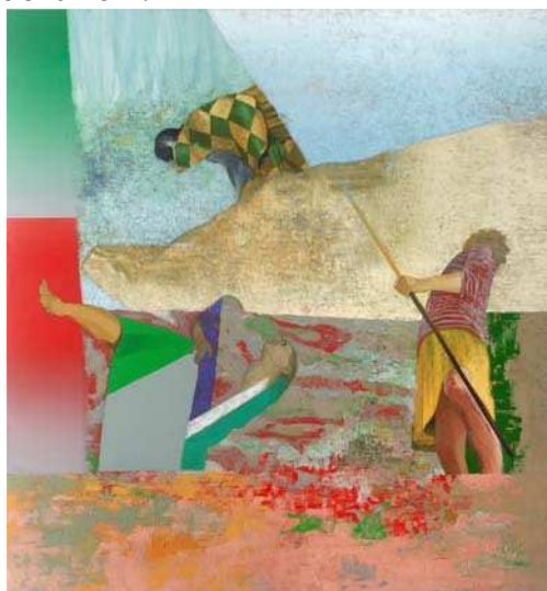
Bart De Clercq, The Rock . 2011, oil on canvas, 225cm x 238cm. Private collection.

Let us therefore take a glance at a single image (before we take a close look at it as a theoretical object , as Mieke Bal would claim) 8 from the position demanding to turn the things, always over and over again, upside-down. This could give us but one possible orientation in our search for that something we would prefer to name the meaning of vision – and, hopefully, the meaning of our own position in the world inhabited by images, the visual world we have never been independent from.