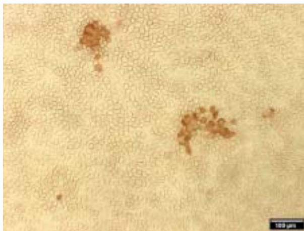
Figure 1. IPMA staining. PRRSV antigens (brown staining) within the cytoplasm of MARC-145 cells. Cells were seeded in 96-well cell culture plates, inoculated with 50 \mu l of PRRSV (Lelystad, Lena or VR-2332) and incubated for 18h (37°C, 5% CO 2 ). Then, the culture medium was removed, and cells were washed in PBS and dried at 37°C for 1h. The plates were kept at -70°C until use. Plates were thawed and then fixed in 4% paraformaldehyde for 10 min. The paraformaldehyde was removed, the cells were washed twice with PBS and a solution of 1% H 2 O 2 in methanol was added. Plates were washed twice with PBS and serial dilutions of the sera were added. Sera were incubated for 1h at 37°C. Plates were washed three times with PBS plus 1% Tween 80 and 50 \mu l of 1/250 rabbit anti-swine IgG HRP-conjugated antibodies (Dako) was added to each well. After incubation at 37°C for 1h, plates were washed three times and 50 \mu l of a substrate solution of 3-amino-9-ethylcarbazole in 0.05 M acetate buffer, pH5, with 0.05% H 2 O 2 was added to each well, and incubated at room temperature for 20 min. Then, the reaction was blocked by replacing the substrate by acetate buffer and the results were determined by examination with a microscope