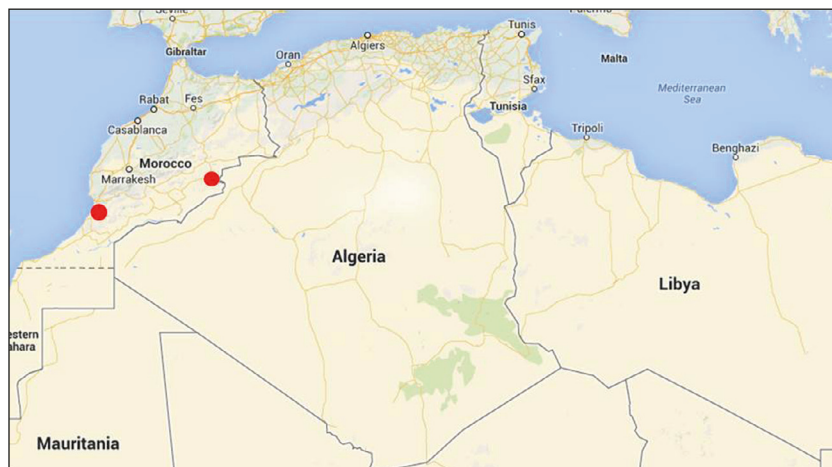
Fig. 17. Distribution of Cithaeron dippenaarae sp. n.