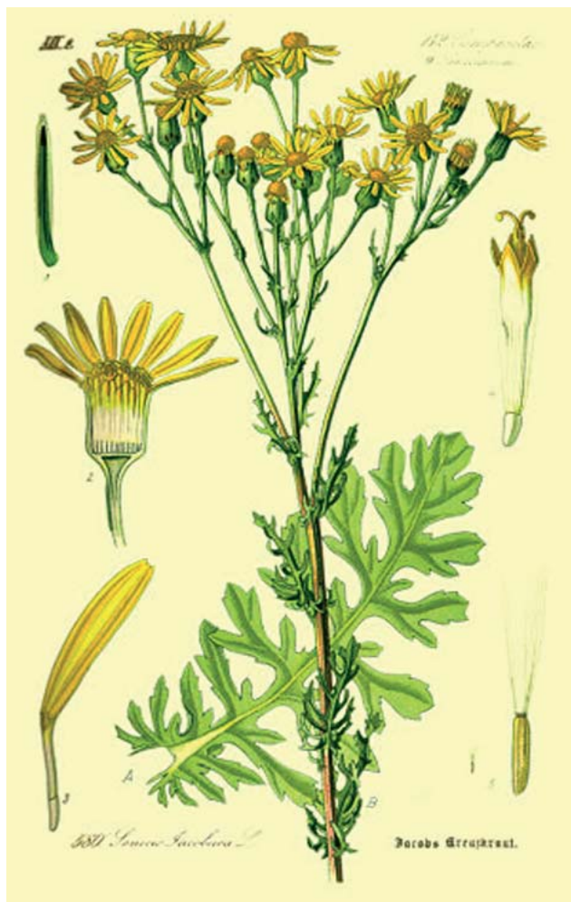
Figure 3. Senecio jacobaea

In 2004, an unusual case of wood poisoning in dogs that ate Simarouba amara shavings was described at the Department of Medicine and Clinical Biology of Small Animals at Ghent University. Simarouba amara , commonly referred to as marupa or caixeta, is a tropical hardwood tree in the Simaroubaceae family from South America. Two male Labradors developed bleeding erosions/ulcerations involving the oral mucosa, mucocutaneous junctions of the lips, nose, prepuce and anus, ulcerated nodules on the chin and crusting lesions on the elbows, hocks and scrotum. The dogs had recently been exposed to bedding containing Simarouba amara shavings and, because of the striking similarities of the clinical signs to those described for horses, a probable diagnosis of wood poisoning was made. This assumption was supported by the clinical course, as healing of the skin lesions occurred when the dogs were no longer exposed to the bedding (Declercq, 2004).