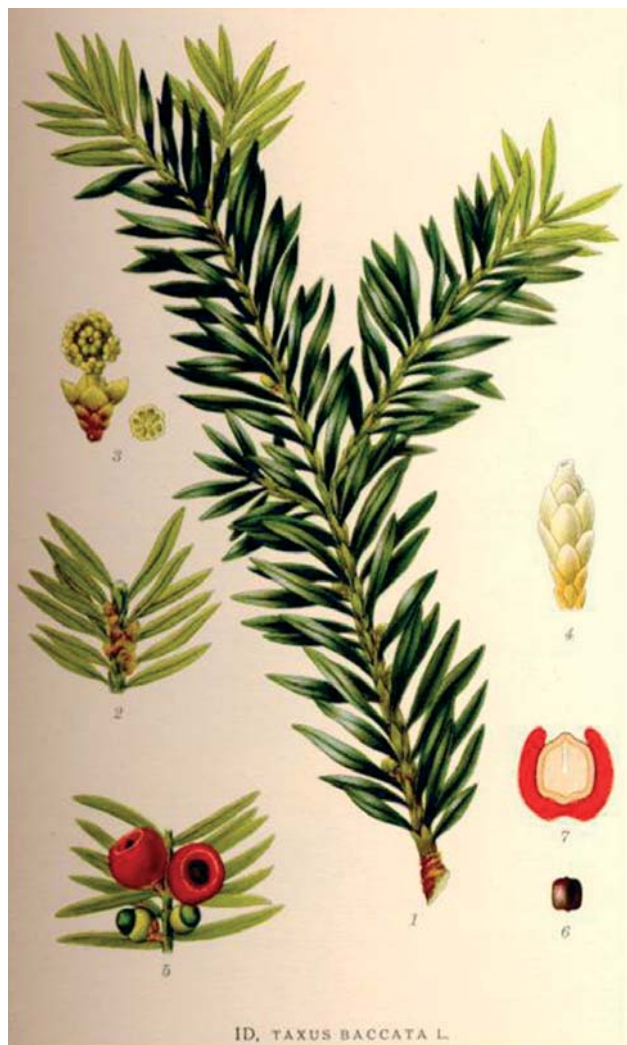
Figure 2. Taxus baccata

The black locust ( Robinia pseudoacacia ) has also been reported to cause fatal poisoning of horses in Belgium, usually after horses are tethered to and subsequently eat the bark of poles made of this wood (S. Croubels, personal communication). Also Nerium oleander is known to cause fatal intoxications in horses (Durie et al. , 2008).