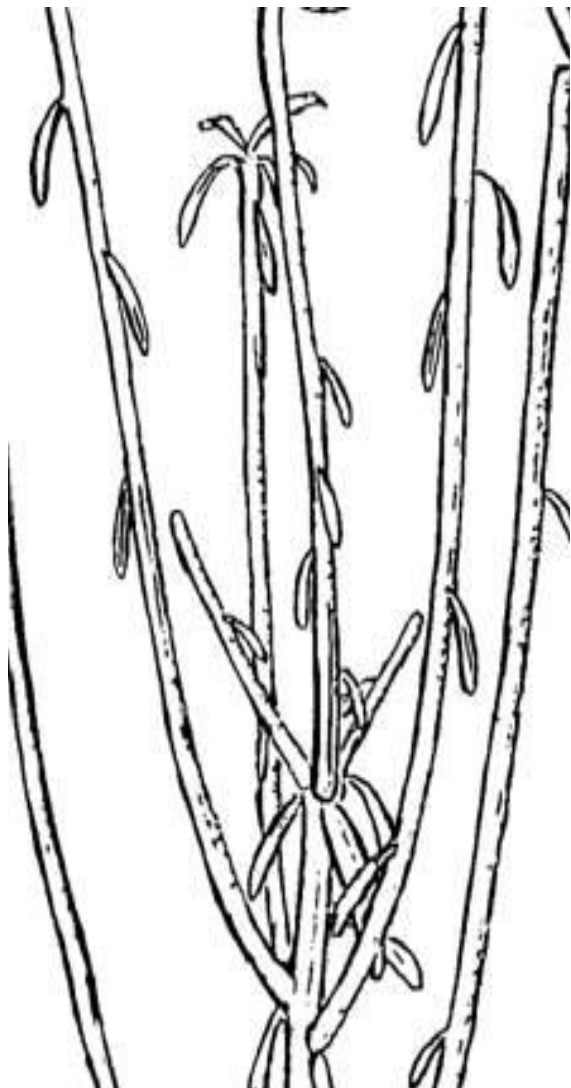
Figure 1. Twig of E. tirucalli showing position of leaves. Courtesy: Van Damme (1989).