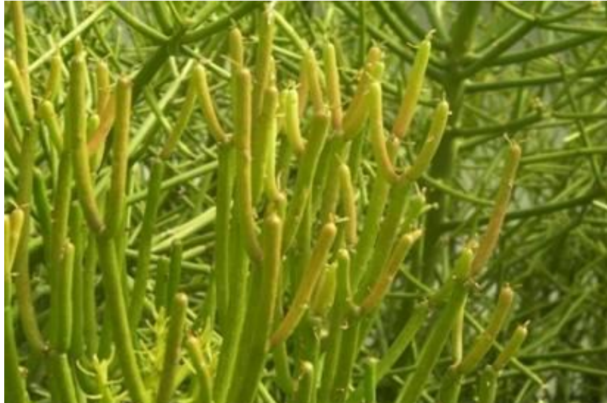
Plate 1. Red pencils of E. tirucalli specimens from US (New York State).

Order: Malpighiales. Family: Euphorbiaceae. Genus: Euphorbia . Species: E. tirucalli . Binomial name: Euphorbia tirucalli L.