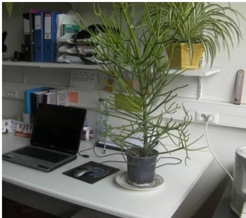
Plate 4. E. tirucalli potted plant as an ornamental.

and swellings. Root scrapings mixed with coconut oil are taken for stomach-ache. In India, Kumar (1999) notes that it is an unavoidable plant in most traditional homesteads and used as a remedy for ailments such as: spleen enlargement, asthma, dropsy, leprosy, biliousness, leucorrhoea, dyspepsia, jaundice, colic, tumors and bladder stones. He further says that although the latex of vesicant and rubifacient is emetic in large doses, it is purgative in small doses and applied against toothaches, earaches, rheumatism, warts, cough, neuralgia and scorpion bites. The same author points out that its branch and root decoctions are administered for colic and gastralgia while ashes are applied as caustic to open abscesses. Duke (1983) and Van Damme (1989) mention that, in Brazil, E. tirucalli is used against cancer, cancrivores, epitheliomas, sarcomas, tumors and warts, although they argue that this has no scientific basis since the same tree is known to be co-carcinogenic. In Malabar (India) and the Moluccas, latex is used as an emetic and anti-syphilitic while in Indonesia, the root infusion is used for aching bones while a poultice of roots or leaves is used to treat nose ulcers, hemorrhoids and extraction of thorns. Wood decoctions are applied against leprosy and hands and feet paralysis following childbirth (Duke, 1983). The same author states that in Java, the plant latex is used to cure skin ailments and bone fractures.