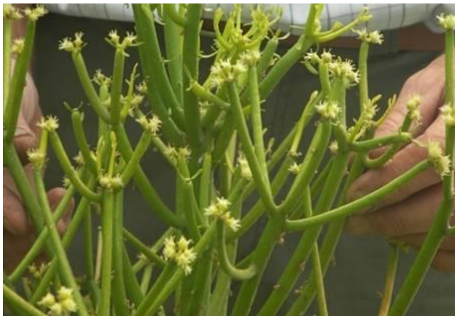
Plate 3. E. tirucalli efflorescence.