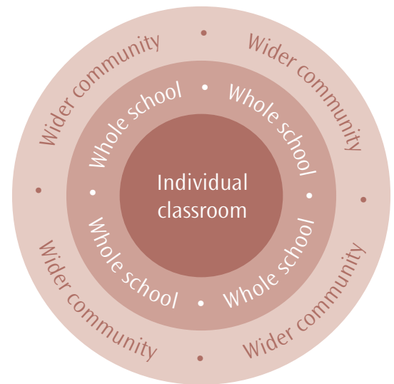
Figure 2. Leadership within, and beyond, the school

However, it is important to recognise that each individual school's community context was unique, and this in turn shaped the leadership response of headteachers.