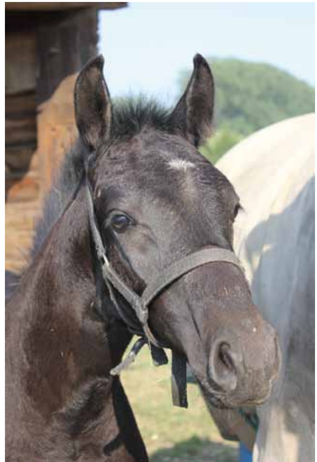
Figure 3. Macroscopic view of the foal two months after excision of the mass.

It is unclear whether spontaneous regression would be possible in large lesions as described in the present study. Retrospective analysis of a larger sample of histologically confirmed cases and follow-up of cases without surgical treatment are needed to elucidate this issue. Based on the low prevalence, multicenter studies will therefore be required. Moreover, additional molecular studies are required to investigate whether or not papillomavirus is involved in this pathology.