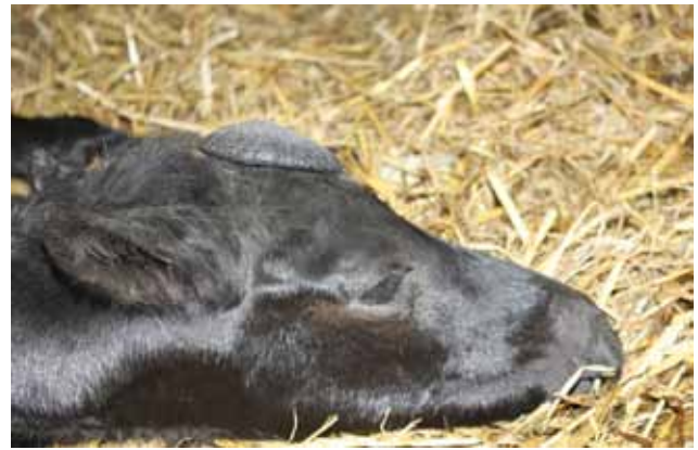
Figure 1. Macroscopic lateral view of the black, flat, oval, pedunculated exophytic mass with a rubber aspect of approximately 10 x 9 x 3 cm on the foal's forehead.

It has been stated that congenital papillomas show the same clinical and histological features as epidermal hamartomas (nevi) in humans (Scott and Miller, 2003; White et al., 2004; Scott and Miller, 2011; Rup-