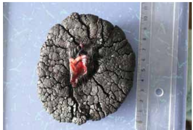
Figure 2. A. Macroscopic dorsal and B. ventral view of the mass after surgical excision through the vascularized peduncle.