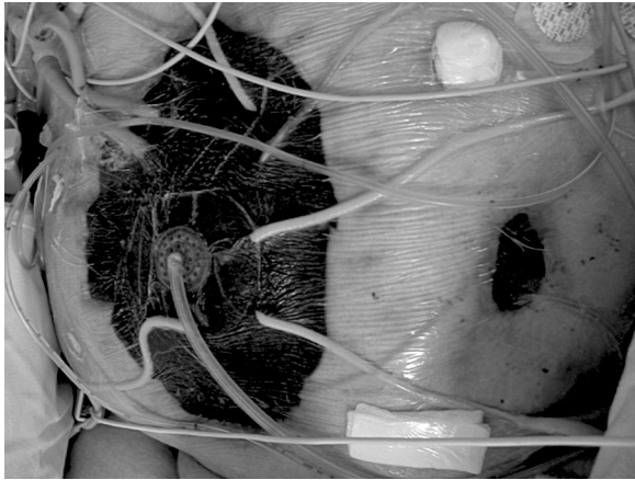
Figure 2. Temporary abdominal closure using negative pressure therapy in a complex patient

bution when compared to the Barker technique, but not leading to increased rates of enteric fistulas [28, 29]. Frazee et al. [30] reported in a retrospective study in comparing ABThera to Barker Vac Pac, ABThera had an 89% closure rate compared to Barker and an odds ratio 7.97 favoring ABThera vs. the Barker technique. A meta-analysis from Roberts et al. [31] also showed a benefit of negative pressure therapy when comparing fascial closure techniques. Lower serum lactate levels, improved intra-abdominal pressures, and lower hospital stays were reported in those patients with a negative pressure device vs. a Barker Vac Pac or a Bogotá bag.