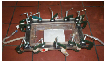
Fig. 1 Flat-plate photoreactor

The air purification potential of coated \text{TiO}_2 enriched concrete samples was investigated on lab-scale using a rectangular plexiglass flat-plate photoreactor which was operated in a flow-through mode with toluene as pollutant model. See Figure 1.