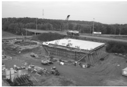
Fig. 2: Construction site near E313