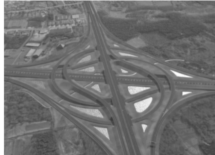
Fig. 1: Motorway interchange – Lummen. Left: old situation with confliction traffic flows. Right: design visualisation.