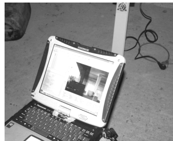
Fig. 4: Trimble GX Advanced controle (left) controlled by Trimble® PointScape™ Software on Panasonic Toughbook CF-19 (right)

To assure full coverage of both the inside and the outside of the bridge element ten scan positions and seventeen targets were used.