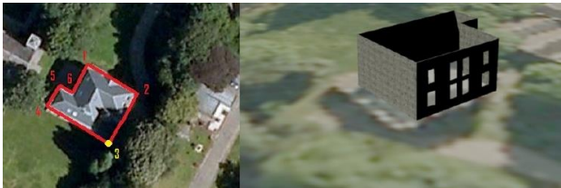
Figure 5: Screenshot of the 3D visualisation of a building

ridge, some windows and doors as well as the general outline have to be measured, in addition to the lampposts in the direct neighborhood. A 3D reconstruction of these elements is generated in a CAD environment and rendering parameters are also defined for a night- and day visualization (Figure 5). The link between the orthophoto, the topographic measurements and DEM is very important for this exercise, as well as the relation between the different error sources and the visualization parameters.