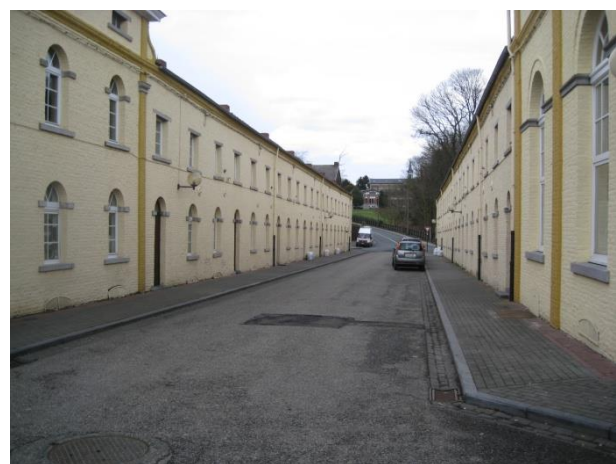
Figure 2: Workers quarters at Bois-du-Luc with the church St Barbara, the hospital, the school for the girls, the hospice, the houses for the engineer and employees, the park with its kiosk, the butcher and "glacière" and school for the boys and the library on the background

From 1838 to 1853, 166 living quarters were built for the housing of the workers, as commissioned by the mining management in order to attract and attach the workers (Figure 2). Moreover, a separated living quarter was built in 1844 for the general director (Figure 3), as well as a grocery, butcher and "glacière", party hall, park and its kiosk, church, schools, library, hospice, hospital, school, houses for employees and engineer, mill brewery. Bois-du-Luc is an illustration of an exemplary conservation of the paternalistic ideology. In 2012, the entire mining site of Bois-du-Luc was recognized as World heritage by UNESCO, next to three other important mining sites in the Wallonia.