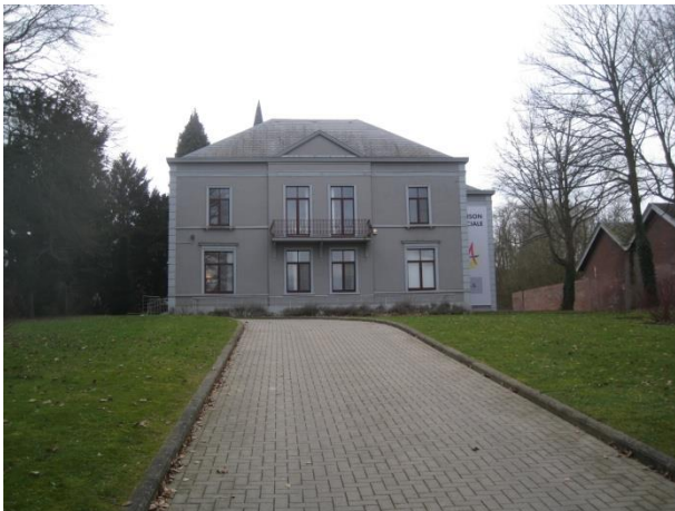
Figure 3: House of the general director (1844)