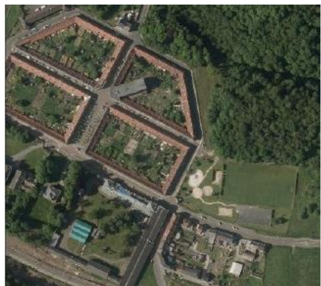
Figure 4: Screenshot of one of the generated orthophotos

In order to perform the exercise, a stereo couple is supplied by the Walloon Region. Reference points and ground control points are measured using RTK GNSS and the WALCORS reference network with centimeter accuracy. The coordinates of both materialized polygon points and unambiguous image points are defined in the Belgian Lambert 72 system. Initially, at least twelve ground control points have to be measured by the students. These points, as well as the calibration parameters of the images, are processed using professional photogrammetric software. This process results in an orthophoto and DEM of the site. A screenshot of the orthophoto is presented in Figure 4.