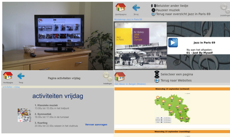
Fig. 4. Screenshots services