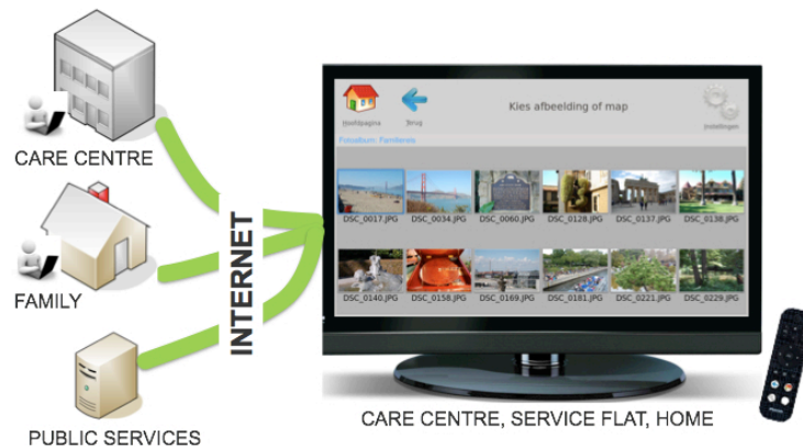
Fig. 3. The TV-Kiosk prototype

extensibility, a plugin system has been used to implement the services and easily allow the creation of new services. In the following paragraphs we elaborate further on the design requirements we considered and the developed services.