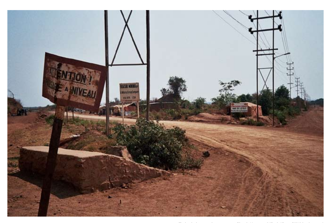
The border between the concessions of Ruashi Mining and L'Etoile/Chemaf (IPIS October 2009)