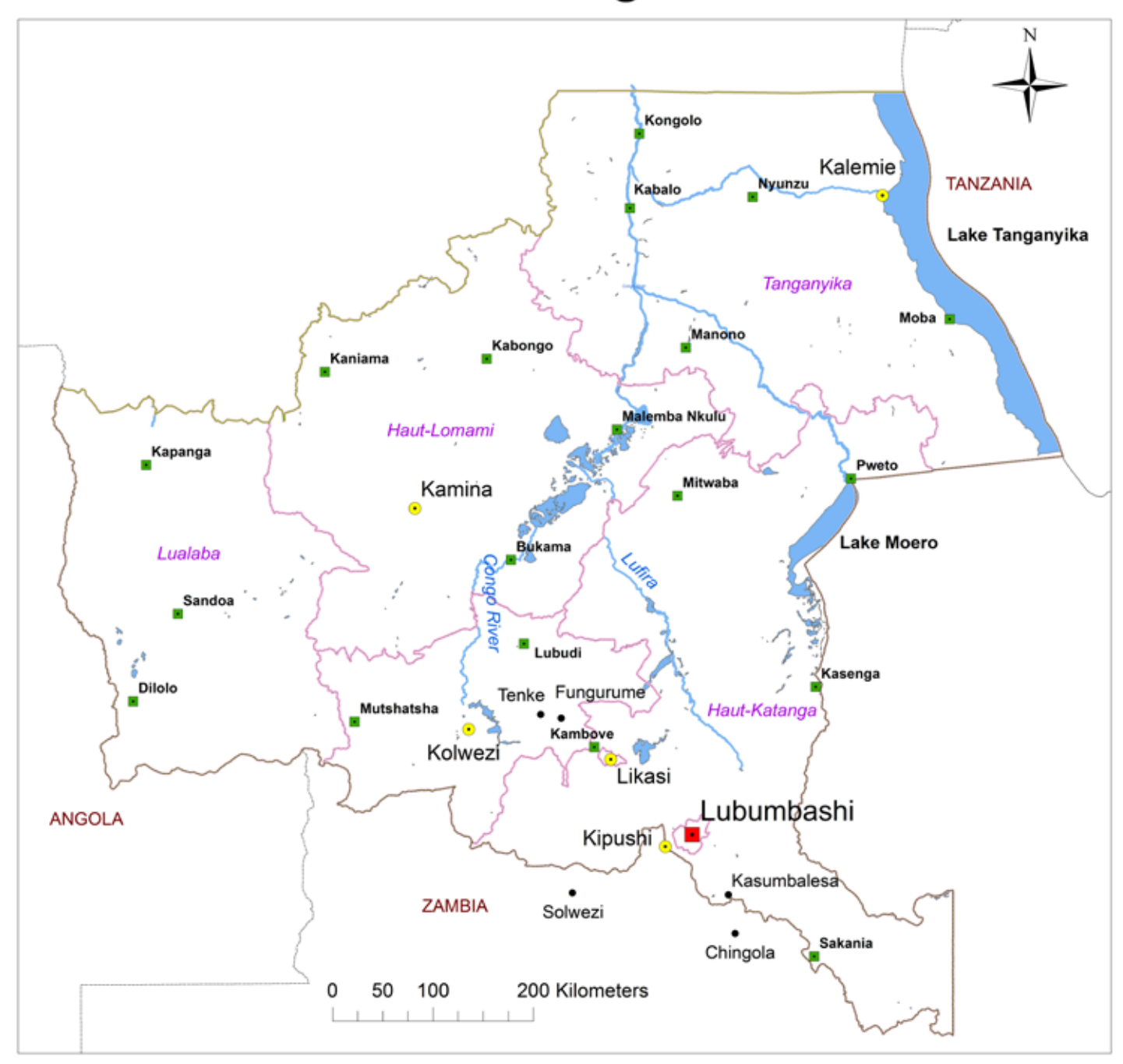
IPIS July 2009 (cartographic source: Référentiel Géographique Commun, www.rgc.cd)