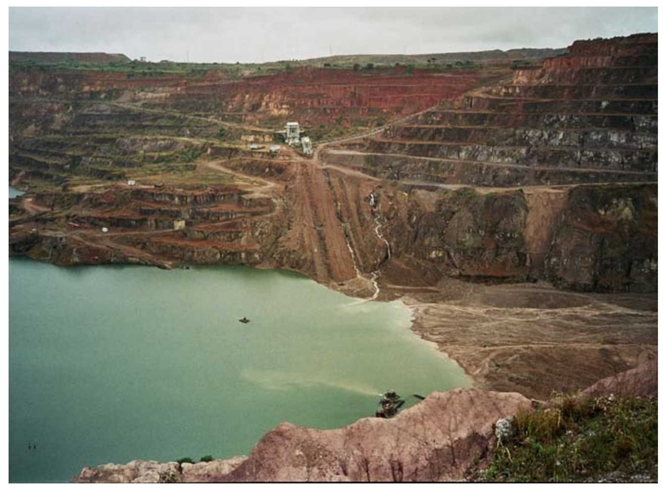
Katanga Mining, the inundated mine of T57 (IPIS February 2008)

Given the importance of the mining sector as a source of revenue for the Democratic Republic of the Congo, the development of a sound policy for crisis management is of vital importance to protect the health of the Congolese Treasury and to keep intact the possibility of stepping up government efforts in terms of poverty reduction and infrastructure development once the global economy starts to recover. This report shows that both the central government in Kinshasa and the provincial government in Lubumbashi have taken a number of measures to cope with the consequences of the global financial crisis. Unfortunately, there are indications that the ongoing decentralisation process tends to complicate the cooperation between the two governments. Moreover, as a result of the exaggerated attention for the so-called 'rétrocession' issue in the Congolese press, there is a real risk that the anti-crisis measures of the Congolese authorities are not examined in a critical manner.