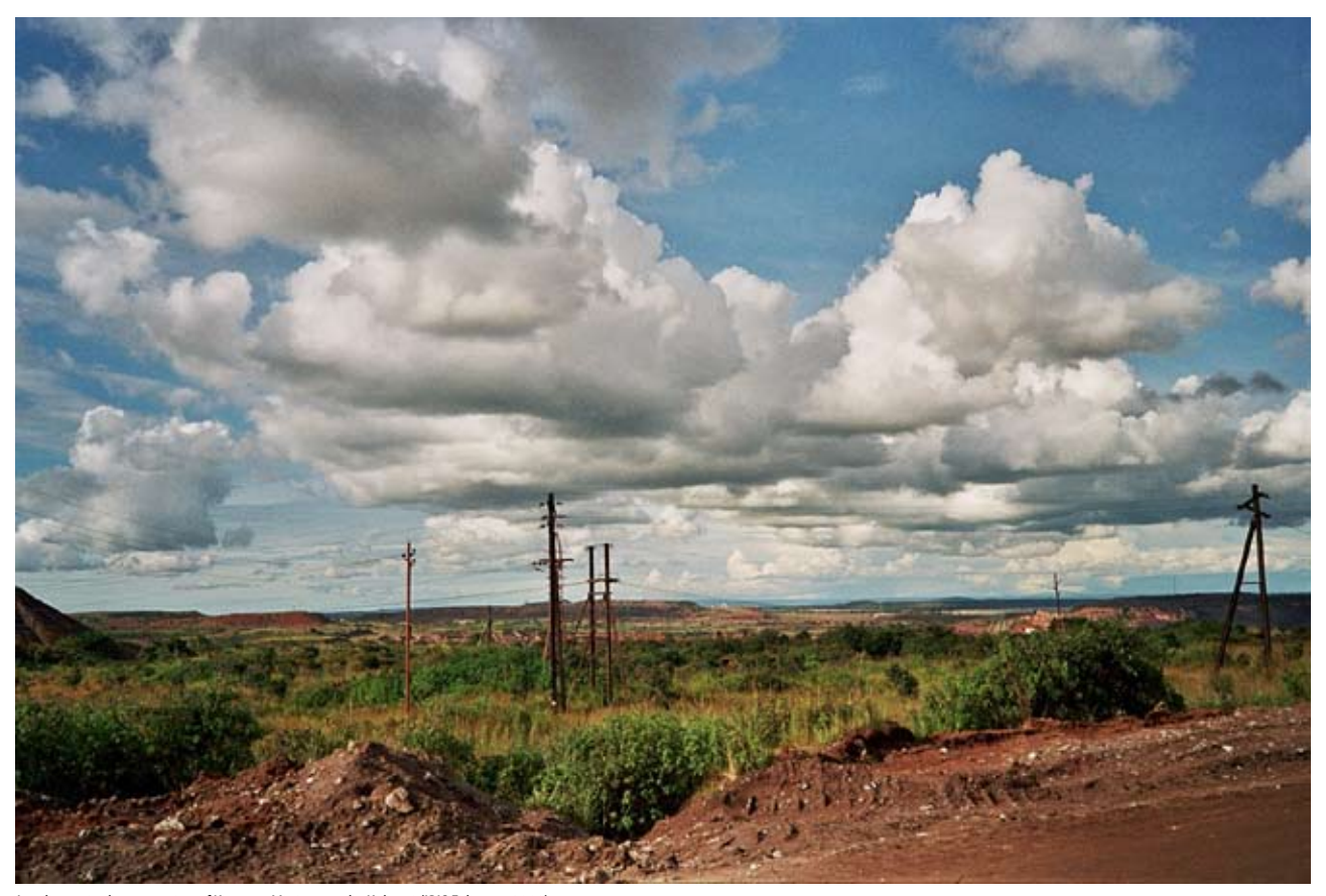
Landscape in the concession of Katanga Mining nearby Kolwezi

When mineral prices were still booming, the urban centres in Katanga witnessed a fast-growing demand for accommodation. Large numbers of foreign mineral buyers came to Lubumbashi, Likasi and Kolwezi in order to negotiate deals with local buying houses ( maisons ) or to establish buying houses of their own. Local city-dwellers who were eager to take advantage from this sudden accommodation scarcity, claimed huge sums of money as a deposit or even went as far as fraudulently letting out parts of their houses to several people at the same time, in order to be able to pocket more than one deposit. They used the money to engage in trading activities, to pay for the education and the marriages of their children or to cover other expenses. Now that the heyday of the mineral business is over, landlords are massively faced with tenants asking for the immediate reimbursement of their deposit. Since, in most cases, the former already consumed all the money of the deposit a long time ago, they find themselves unable to comply with the latter's requests. Needless to say, they are very often confronted with lawsuits as a result of this<sup>55</sup>.