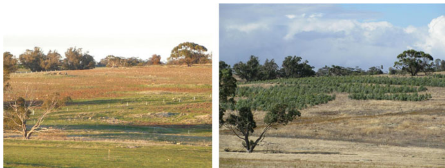
Figure 2 Ridgefield before (2 August 2010) and after (17 April 2012) planting to restore multiple functions.