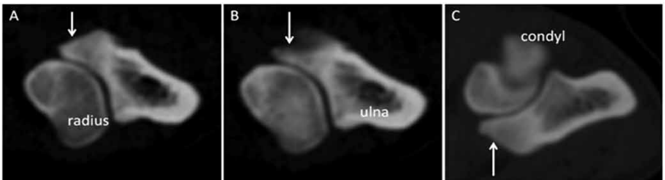
Figure 3. Transverse CT images in bone algorithm at the level of the medial coronoid process of the affected dog. A and B. In the left elbow, a radiolucent fissure line and the heterogeneous aspect of the medial coronoid process are noticed (white arrows). C. The right elbow shows the appearance of a normal coronoid process (white arrow).

Arthroscopy was performed using a standard medial approach (Van Ryssen et al., 1993). There was a chronic synovitis, chondromalacia of the medial coronoid process and a limited partial thickness erosion of the radius. The medial part of the humeral condyle