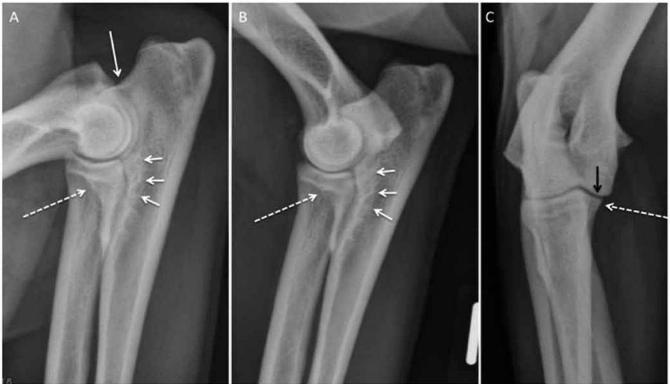
Figure 2. Three standard radiographic views of the left elbow of the presented case. A. Flexed mediolateral projection: osteophytes are absent at the anconeal process (no osteoarthritis - white arrow), the medial coronoid process is radiolucent (dotted arrow) and subtrochlear sclerosis (short arrows) is minimal. B. Extended mediolateral view. The medial coronoid process is ill-defined (dotted arrow) and mild subtrochlear sclerosis is also seen (short arrows). C. 15° Oblique craniocaudal view showing congruent joint surfaces, rounded medial humeral condyle (black arrow) and normal triangular shape of the medial coronoid process (dotted arrow).

ulna was moderately sclerotic, but there were no signs of osteoarthritis (Figure 2). The new bone formation adjacent to the ulnar trochlear notch was also evaluated by the measurement of the ulnar subtrochlear sclerosis, using a percentage scale, described in a study in Labrador retrievers (Smith et al., 2009). A result of 41% was measured, which was lower than the median value of diseased elbows (47%) observed in the study of Smith et al. (2009), which should be interpreted as not-indicative of MCD. The right elbow showed no relevant radiographic pathology.