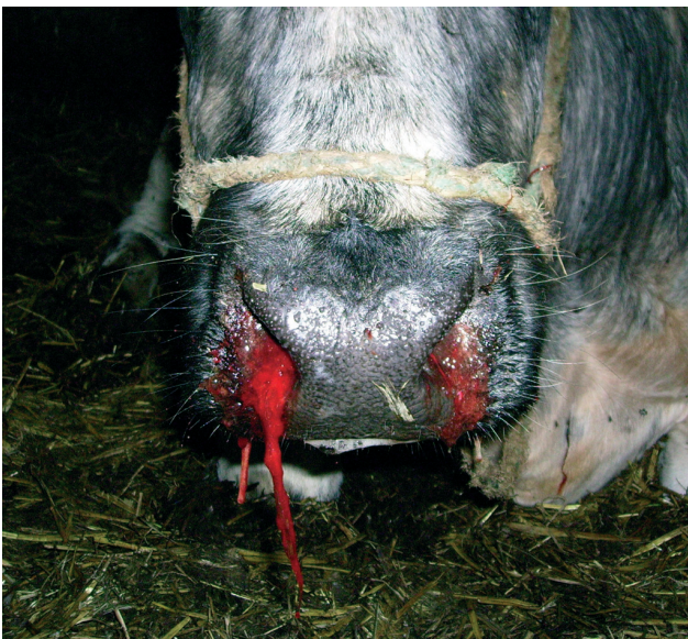
Figure 1. Epistaxis in a three-year-old Belgian blue cow suffering from coagulation disorders due to acute bracken fern poisoning.

The cow was anorectic, depressed, in sternal recumbency, and showed signs of dehydration (sunken eyes). Epistaxis from both nostrils (Figure 1), streaks of blood in the neck and flank regions (insect bites), scleral ecchymosis and petechial bleeding on the conjunctivae and gingival mucosae were obvious. On the udder and teats, red lesions were observed. The animal was severely pyretic (41.4°C), and had an elevated pulse and breathing rate. Regarding the gastro-intestinal tract, ruminal contractions were absent, and melena was observed.