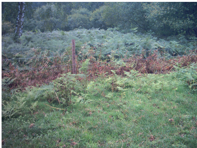
Figure 2. Adult plants of Pteridium aquilinum outside the pasture enclosure and regrowth of fronds within the enclosure observed one week after stabling of the animals.