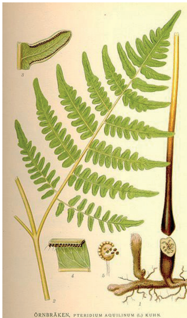
Figure 3. Pteridium aquilinum

The toxic substances are cyanogenic glycosides (mainly prunasin), a vitamin B 1 -decomposing enzyme (thiaminase) and factors with carcinogenic activity (particularly ptaquiloside) (Fenwick, 1988; Vetter, 2009). The cyanogenic glycosides have only very seldom led to cyanide poisoning in animals (Fenwick, 1988), while thiaminase induces a vitamin B 1 -deficiency in non-ruminants. Horses are particularly susceptible (Evans et al. , 1951; Kelleway and Geovjian, 1978), while reports of acute bracken intoxication in pigs are less common, except in young animals after long term exposure (Harwood et al. , 2007). Affected animals initially show anorexia and ataxia, followed by convulsions and death. Ruminants on the other hand are generally resistant, due to the synthesis of vitamin B 1 by the ruminal microbiological flora. However, polioencephalomalacia associated with vitamin B 1 -deficiency has been experimentally induced in sheep using bracken fern rhizomes (Bakker et al. , 1980). In