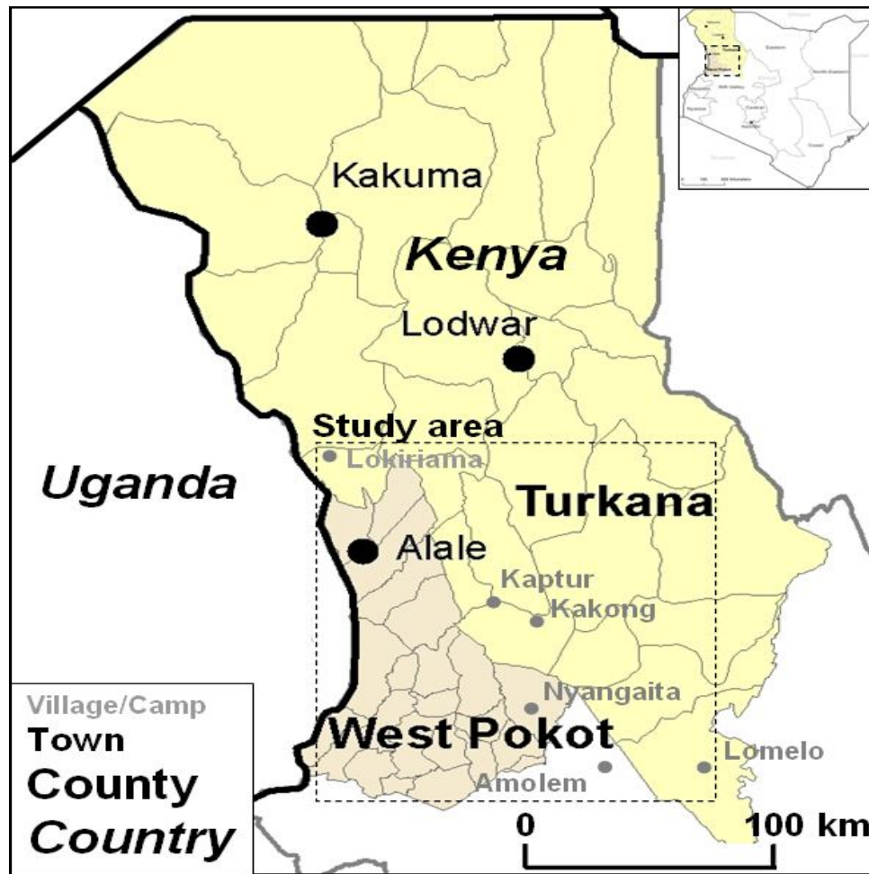
Figure 1. Study areas in Turkana and Pokot counties, Kenya.

Vétérinaires Sans Frontières-Belgium (VSF-Belgium), developed and implemented community resource use plans and inter-community reciprocal grazing agreements as strategies for mitigating resource-based conflicts. The study covered 10 mobile pastoralist villages namely: Lokwamusing, Elelea, Kakongu, and Kaptur in Turkana County and; Amolem, Nyangaita, Amaler, and Tikit in Pokot County. Data collection within the DMI project was conducted between August 2008 and December 2010. The fieldwork involved focus group discussions (FGD) and key informant interviews with herders, elders, raiders, opinion leaders, local provincial administrators and officials of development agencies working in the study area. Eight FGDs, each comprising 20 to 25 persons of different gender and age groups sampled from each village, were conducted. In order to answer the research questions, data collection focused on livestock grazing movements, resources availability, conflict causes, livestock raiding and mitigation strategies. Other sources of information included informal discussions with government officials, development agencies workers and