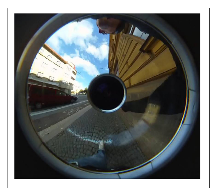
FIGURE 1 | Example of the video frame capturing a subject entering the track section.

The selected musical pieces were used in Music B at the original tempo. Music A was 8% slower, music C was 8% faster.