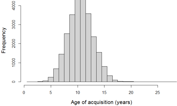
Distribution of the AoA ratings collected in the present study (AoA is age in years at which the word was acquired).