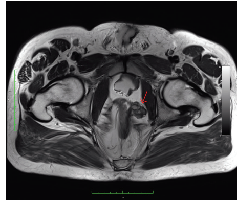
FIGURE 1: Pelvic MRI of the patient. The arrow demonstrates the pararectal GIST.

Console time was 130 min and estimated blood loss was 200 cc. No intraoperative complications were encountered. Convalescence was uneventful with the patient passing flatus on day one. Clear liquids were consumed on the first postoperative day, which was switched to a fiber-free diet for 7 days before starting a normal diet. The patient was discharged the third day postoperatively. The histopathology report revealed a GIST, with a maximum diameter of 3.3 cm consisting of a proliferative cell-rich component with spindle cells and areas of hemorrhage and necrosis. The other component was cell poor with mucoid degeneration and some vital tumor cells. The tumor cells were CD117- and CD34-positive. The surgical margins were negative and the lymph nodes were free of tumor as well.