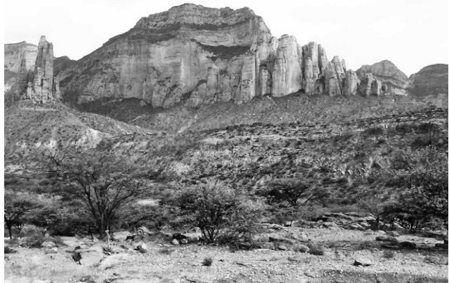
FIGURE 2 Partial view of Mount Kemer, from Da Tsimbia. The TDZ is located behind the ridge. Note the presence of small remnant forests on inaccessible flats.

communicate in Amharic, though most elder people also know Tigrinya. There are many cross-marriages, girls from Hidmo who marry at the other side of the river.” Quarrels over land use rights do not seem to have an ethnic flavor—they are rather similar to what may occur between neighboring villages within Tigray.