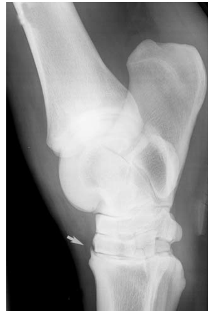
Figure 8. Lateromedial view of the hock. The arrow points at a bony spur with well defined contour on the dorsoproximal aspect of the third metatarsus without any change of opacity either in the joint margins or in the subchondral bone. This radiographic finding is not considered a DJD sign, but rather an incidental finding without clinical significance.