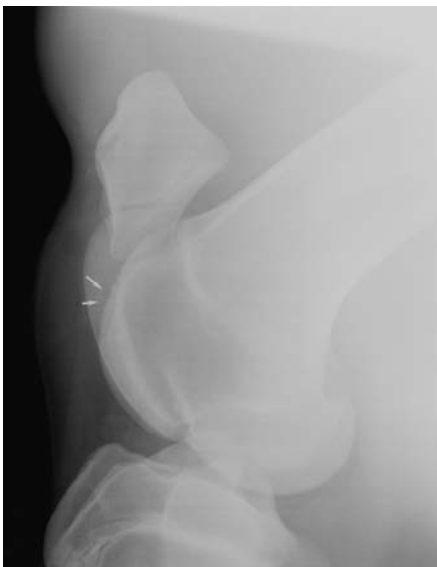
Figure 9. Lateromedial view of the stifle. There is an area (arrow) with irregular surface of the subchondral bone and decreased and heterogeneous radiopacity in the proximal half of the lateral trochlear ridge of the femur.