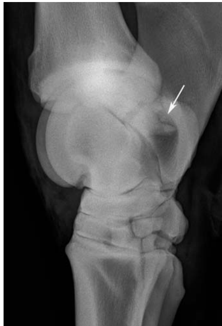
Figure 7. Lateromedial view of a hock. There is a faint radiolucent line in the region of the proximal tubercle of the talus separating a plantar bony fragment (arrow).