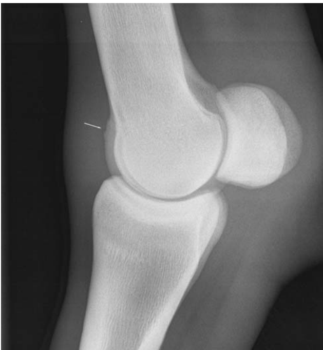
Figure 3. Lateromedial view of a front fetlock showing a mild irregularity of the proximal part of the sagittal ridge of the third metacarpal bone condyle.