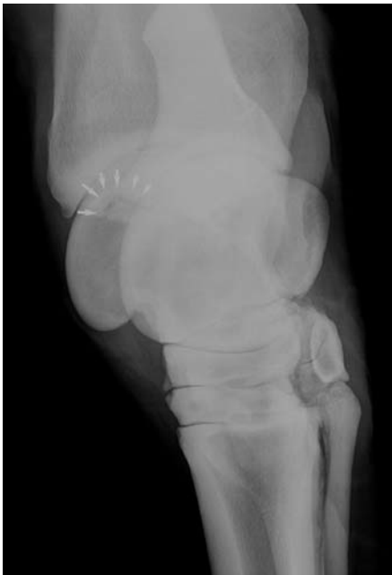
Figure 6. Plantarolateral-Dorsomedial Oblique view of the hock. The arrows point at a radiolucent line separating an osteochondral fragment of the distal intermediate ridge of the tibia.

The objective of this study was to determine the prevalence of abnormal radiographic findings related to DOD in limb joints of stallions presented for