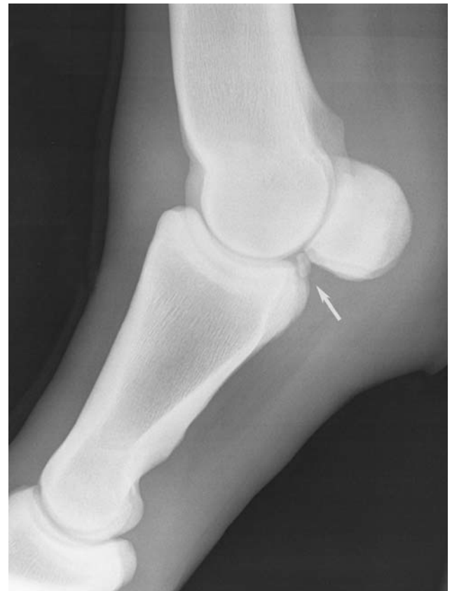
Figure 5. Lateromedial view of a hind fetlock. There is a radiopaque plantar bony fragment in the sesamoido-phalangeal space (arrow).