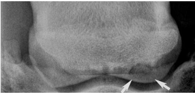
Figure 1. 55° Dorsoproximal-Planterodistal Oblique view of the navicular bone. The arrows point at the fragment of the distal border of the navicular bone.