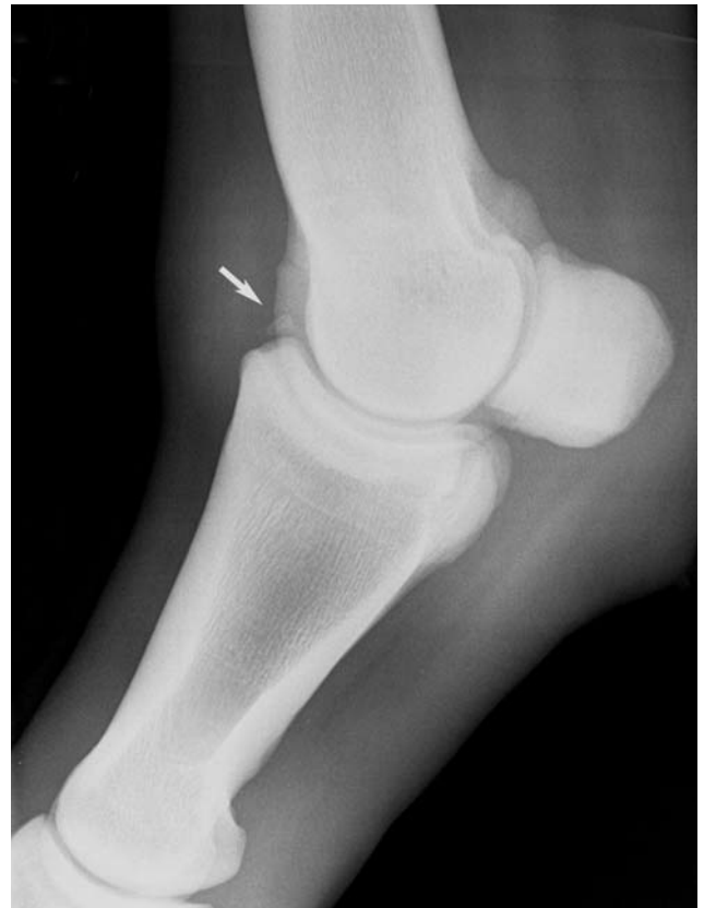
Figure 4. Lateromedial view of a hind fetlock. The arrow points at an osteochondral fragment located at the dorso-proximal border of the proximal phalanx.