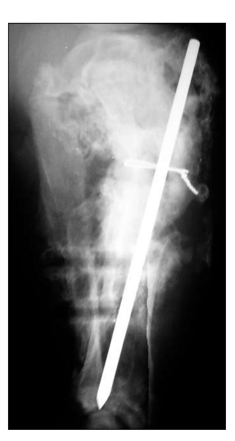
Fig. 3 Radiographs after removal of the transfixation pins at 82 days post-operatively: an important periostal reaction over the total length of the tibia has occured. The intramedullary pin migrated distally and the sharp end almost penetrates towards the tibiotarsal joint.

Fracture repair in food producing animals is seldom performed. Nevertheless, tibial fractures have been repaired successfully in