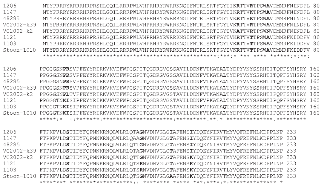
Fig. 2. ORF2 amino acid alignment of the PCV-2 strains used in this study. GenBank accession numbers are: EF990644 (1206), AJ293869 (1147), AF055394 (48285), EF990646 (VC2002-k39), EF990645 (VC2002-k2), AJ293868 (1121), AJ293867 (1103) and AF055392 (Stoon-1010). An asterisk indicates a single, fully conserved residue, a colon indicates conservation of strong groups, and a dot represents conservation of weak groups; spaces indicate no consensus (amino acids shown in bold).