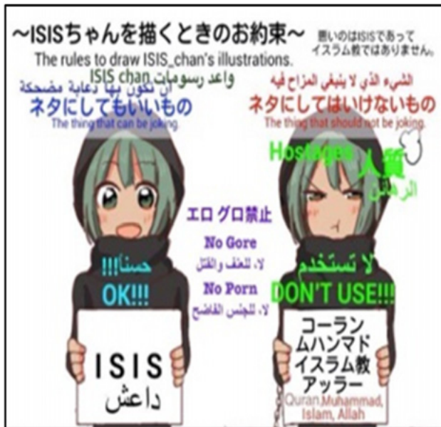
Figure 10: Guidelines for ISIS Chan.

should fill the results of the image search on “ISIS” with presentations of the anime girl. In the first 24 hours, the hashtags were used 9.000 times on Twitter (ibid.). Figure 11 shows ISIS Chan with a melon on a plate. She holds the knife wrongly at her throat. The subscriber explained that she wanted to teach the ISIS what knives are actually for: cutting melons. 1