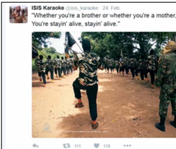
Figure 13: @isis_karaoke IS fighters dance presumably with “Stayin’ alive”.