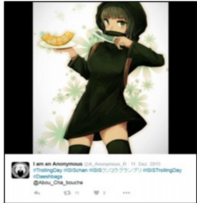
Figure 11: ISIS Chan with a melon.

it was important to show that ordinary citizens have other things to do than joining a worldwide religious war. The account ISIS_Karaoke acts according to the motto “dropping songs, not bombs” and provides pictures of IS fighters with lines from pop songs. The background of this is the new prohibition of music of the IS in Raqqa, the capital of the so-called caliphate. 3 Figure 13 shows Jihadists, which presumably perform “Stayin’ alive” from the Bee Gees.