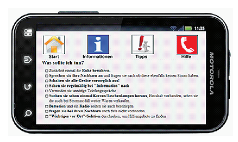
Figure 4. Screenshot of the prototypical application concept "Blacom" for blackout communication

The concept, implemented as a prototype, was evaluated in a qualitative summative evaluation that included 12 participants (Table 3) (duration: Ø 35 minutes; bandwidth: 20-40 minutes). The participants were chosen based on previous knowledge regarding power outages and risk preparation, as well as technical understanding in order to be able to assess the operability and the benefit more profoundly, and availability. In the beginning, the possible problem scenario was explained to the users. Especially those problems that are often underestimated and forgotten and mainly occur during longer blackouts (e.g. the failures of inventory control systems or water supply) were mentioned. Afterwards, the main idea of the concept – information transmission as early as possible - and its functionality were presented. The participants were then told to use the prototype by themselves using the "thinking