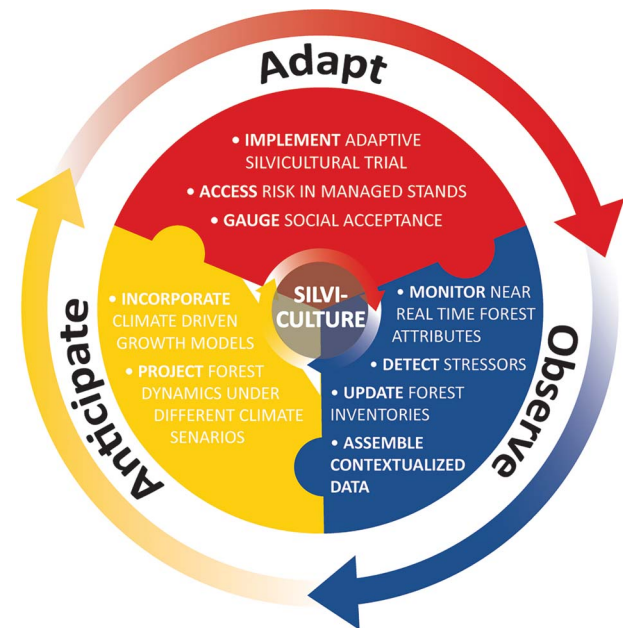
Figure 1 Our conception of silviculture as holistic scientific discipline is framed by three key themes: observe, anticipate and adapt.

The idea for this review initiates from a workshop on the future of silviculture held in Montreal in March 2019. Researchers and practitioners from across Canada had the chance to exchange