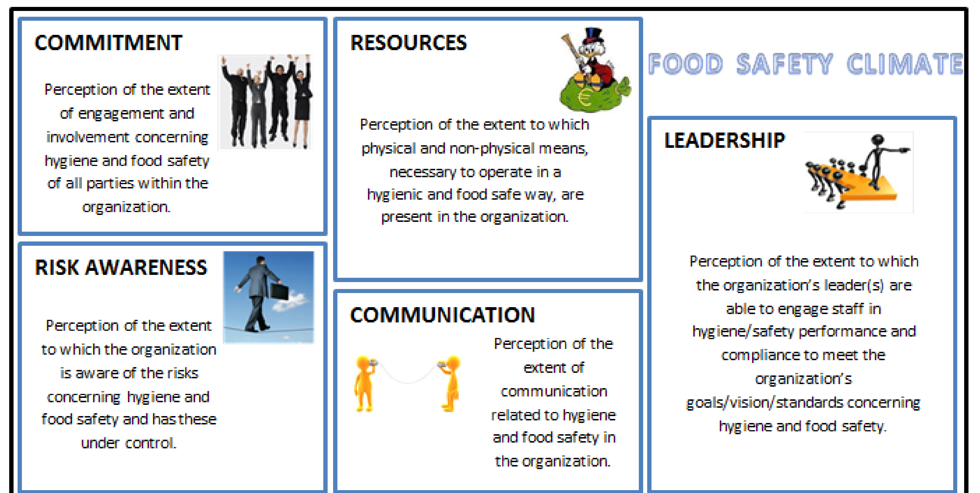
Figure 2: Components of Food safety climate (based on Griffith et al. 2010)